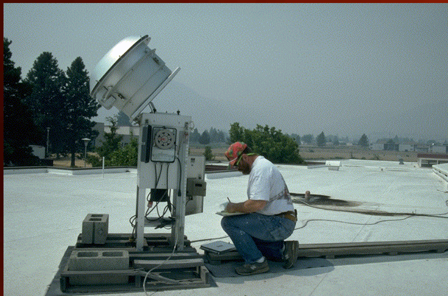
PM10 High Volume