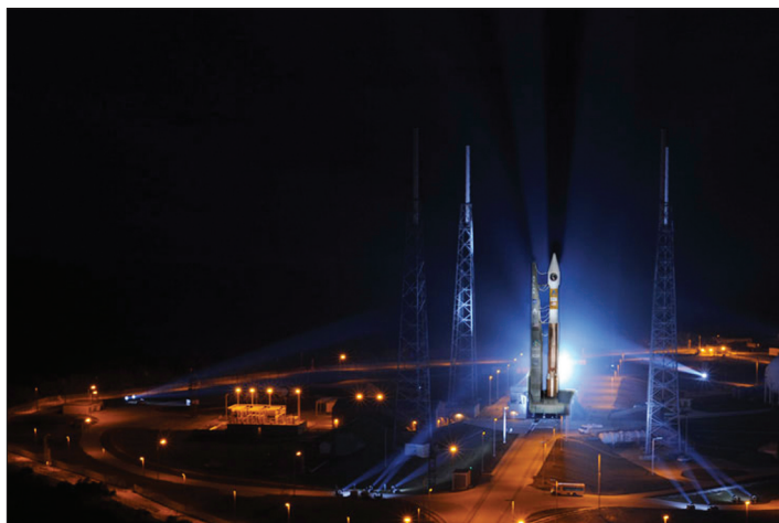
Figure 1. NROL-24 ready for launch at Space Launch Complex-41, Cape Canaveral AFS, Florida, December 2007.

The remainder of this article will address the NRO’s “other” space launch partner—the National Aeronautics and Space Administration (NASA). Indeed, the Air Force, NRO, and NASA have been working together to access space since the late 1970s when the Space Shuttle was designated the primary means of deploying US government payloads into space. Exceptionally close coordination was the order of the day as Air Force, NRO, and NASA personnel worked together in planning the integration and deployment of very complex spacecraft. This spirit of cooperation has remained strong even after the transition back to expendable launch vehicles following the loss of space shuttle Challenger in 1986.