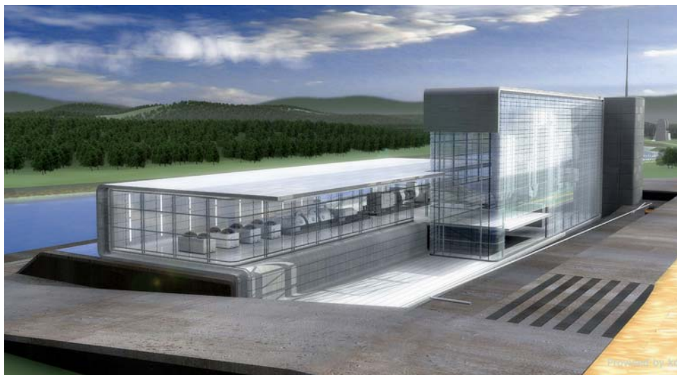
Figure 10-5. CCTP's portfolio supports the development and demonstration of revolutionary coal-based technologies, such as FutureGen, that is expected to produce electricity, hydrogen, fuels, and chemicals with nearly zero emissions of GHGs.

Finally, should widespread adoption of advanced climate change technologies be pursued, as guided by science, it would likely need to be supported by appropriate technology policy, potentially including market-based incentives. As Federal efforts to