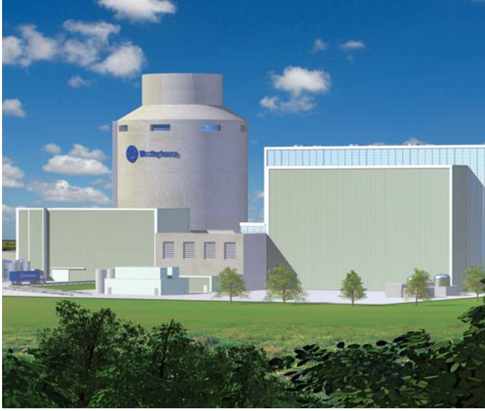
Figure 10-4. CCTP's portfolio supports near-term deployment of civilian nuclear power, such as Westinghouse's AP1000. Nuclear power safely produces electricity with little or no GHG emissions.

Courtesy: Westinghouse Electric Company, LLC