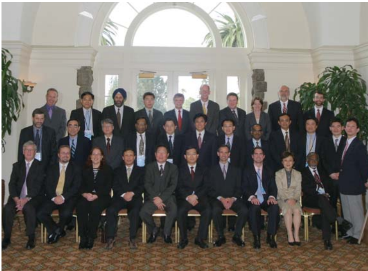
Figure 10-8. Asia-Pacific Partnership on Clean Development and Climate; Second Policy and Implementation Committee and Task Force Meeting, Berkeley, California - April 18–21, 2006, http://www.asiapacificpartnership.org .