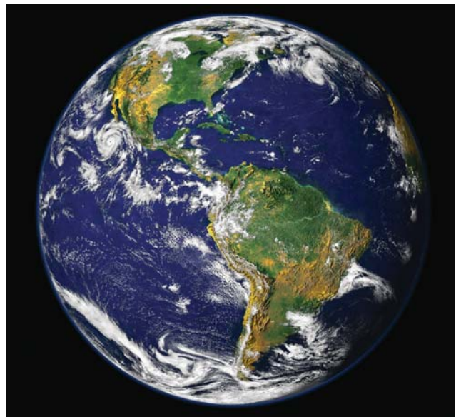
Figure 10-1. The United States is working to ensure a bright and secure energy and economic future for the Nation and a healthy planet for future generations.

Under the auspices of the Cabinet-level Committee on Climate Change Science and Technology Integration (CCCSTI), the Climate Change Technology Program (CCTP), led by the Department of Energy (DOE), represents the technology component of this strategy. Authorized by the Energy Policy Act of 2005, CCTP functions as a multi-agency planning and coordination entity. CCTP is charged with reviewing and prioritizing the Federal Government's climate-related technology programs. Its activities are guided by the CCCSTI and carried out by representatives of the participating R&D agencies. CCTP provides strategic direction for and coordinates an investment portfolio of climate-change