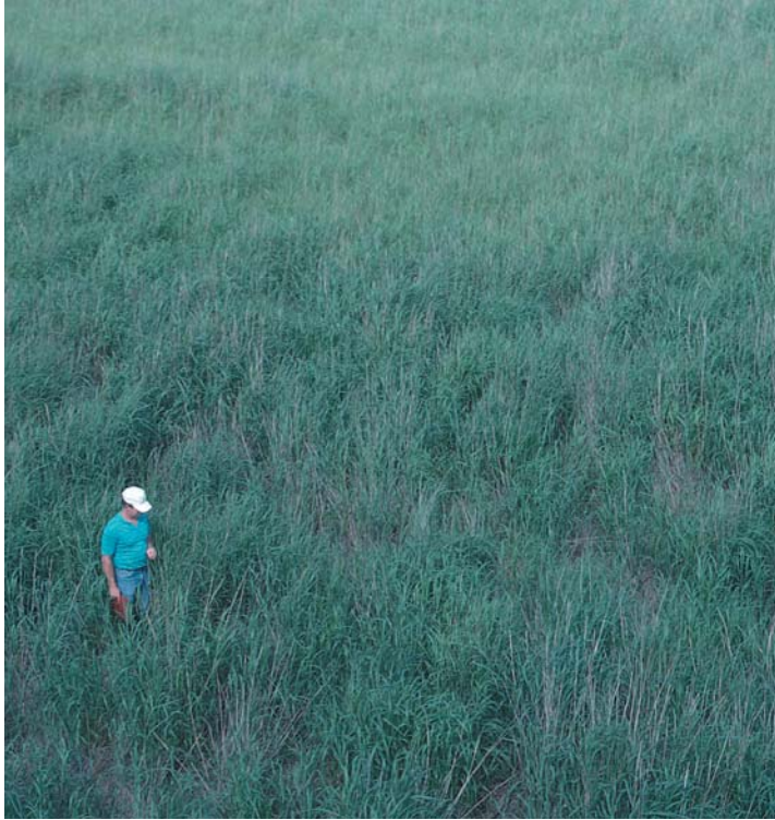
Figure 10-6. CCTP's portfolio supports research to transform switchgrass (shown), other agricultural and forest products, cellulosic plant matter, and associated detritus (e.g., residential waste) into bio-based fuels, which are low in net emissions of GHGs.