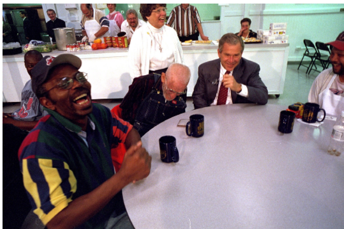
Good company. President Bush visits the St. Augustine Parish Hunger Center in Cleveland, Ohio in May 2001.

The Administration is also working to mobilize the armies of compassion to help at-risk children most in need. In 2005, the President's Budget provides $50 million in competitive grants to train adult volunteers as mentors to children whose parents are incarcerated, and $100 million to schools and community-based organizations for school-based mentoring.