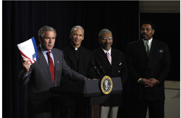
Putting it together. President Bush discusses his faith-based initiative with urban leaders gathered at the White House.

America's need and potential for service remain great. The President's Budget addresses this need and this potential by requesting the highest funding level in history for the Corporation for National and Community Service. It includes $442 million for AmeriCorps and $225 million for SeniorCorps to meet the President's commitment of supporting 75,000 AmeriCorps members and 600,000 SeniorCorps volunteers. The Budget also includes $20 million for Silver Scholarships for older Americans who volunteer 500 hours of service tutoring and mentoring students, in exchange for a $1,000 scholarship. Seniors may transfer their scholarships to a grandchild or young person.