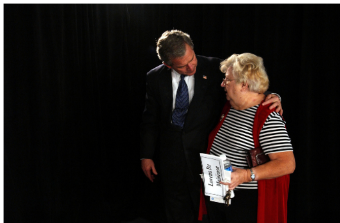
Listen first, then act. President Bush takes a private moment to discuss Medicare. In December 2003 the President signed into law the first major improvement in Medicare since 1965.

Medicare is being strengthened in other ways. In 2005, seniors will receive a "welcome to Medicare" physical that will include screening for cancer, diabetes, and heart disease, as well as immunizations