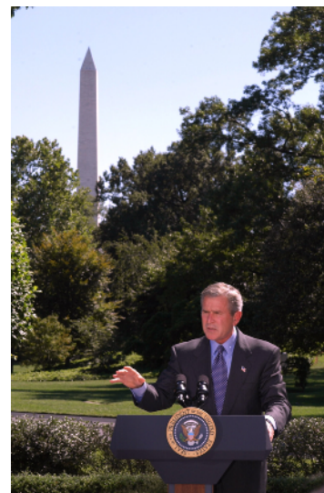
A clear day. President Bush calls on the Congress to pass Clear Skies legislation on September 16, 2003.

The Clear Skies Initiative would create a mandatory program to dramatically reduce power plant emissions of sulfur dioxide (SO 2 ), nitrogen oxides (NO x ), and mercury by setting a national cap on each pollutant. Over the next 10 years, Clear Skies would achieve substantially greater reductions in pollution from power plants than are attainable under current law. The Clear Skies approach would deliver guaranteed emissions reductions of SO 2 , NO x , and mercury at a fraction of command-and-control costs, increasing certainty for industry, regulators, consumers and citizens, while maintaining energy diversity and affordable electricity. Under Clear Skies, tens of