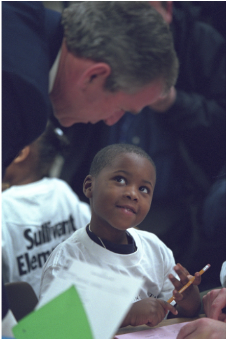
Ready to read. President Bush helps a child with a reading assignment at Sullivant Elementary School in Columbus, Ohio.

standards are getting help, but they are also being held accountable for increasing the achievement levels of their students. Under NCLB, States and school districts are publishing report cards that show how well students in each socio-economic group are achieving. Furthermore, NCLB provides funds for tutoring, so that parents of students in schools needing improvement can select from over 1,600 supplemental service providers approved by the State and find a program that is directed at the specific needs of their child.