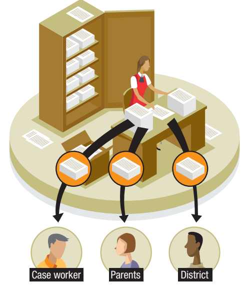
Forms are filled out and delivered to the IEP team

The IEP is reviewed annually by the IEP team to test the child's progress. Boxes of forms must be reviewed. Once again, innacuracy is inevitable.