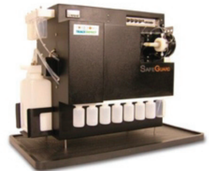
TraceDetect's SafeGuard Trace Metals Analyzer