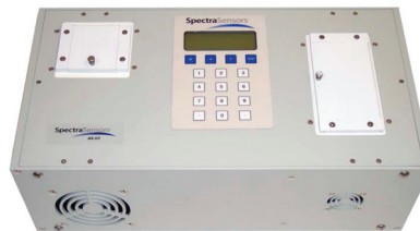
SpectraSensors' As-10™ Trace Arsenic Monitor

In 2001, under the Safe Drinking Water Act, the EPA lowered the maximum contaminant level for arsenic from 50 parts per billion (ppb) to 10 ppb. The new standard became effective on January 23, 2006. EPA estimates that more than 90 percent of the systems affected by the revised rule are small, serving populations of 3,300