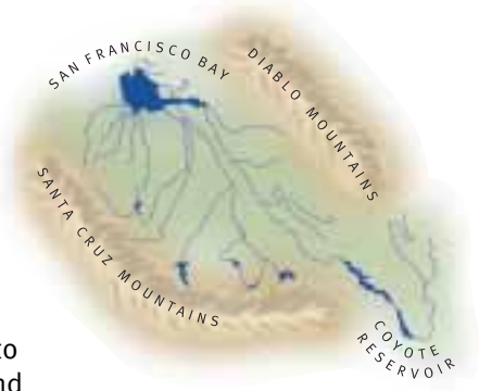
SANTA CLARA BASIN WATERSHED

A watershed is a land area that drains into a creek, river, lake, wetland, bay, or groundwater aquifer. In the Santa Clara Valley, all the water from rain and irrigation which flows over the land surface (called runoff ) goes into storm drains, creeks and rivers that flow directly to San Francisco Bay. You live in a watershed that flows to a local creek, and all of the runoff from your home, yard and neighborhood flows to that creek.