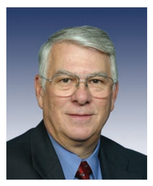
Rep. Donald A. Manzullo of Egan (16th District) Republican—8 terms