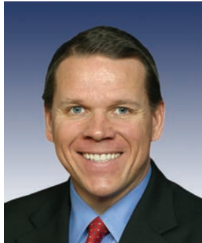
Rep. Sam Graves of Tarkio (6th District) Republican—4 terms