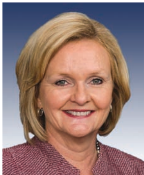
Sen. Claire McCaskill of Kirkwood Democrat—Jan. 4, 2007