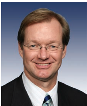
Rep. Kenny C. Hulshof of Columbia (9th District) Republican—6 terms