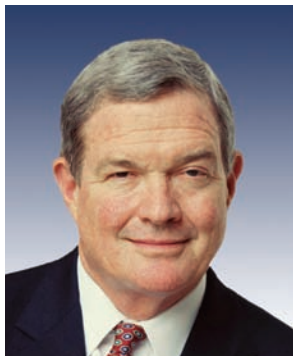
Sen. Christopher S. Bond of Mexico Republican—Jan. 3, 1987