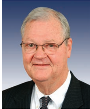
Rep. Ike Skelton of Lexington (4th District) Democrat—16 terms