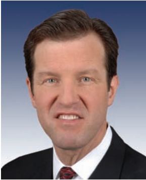
Rep. Russ Carnahan of St. Louis (3d District) Democrat—2 terms