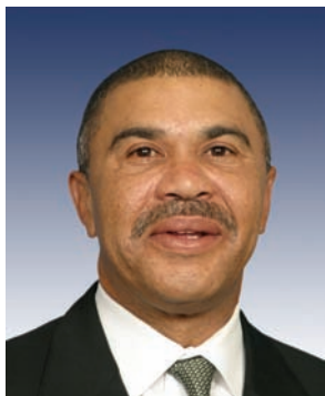
Rep. Wm. Lacy Clay of St. Louis (1st District) Democrat—4 terms