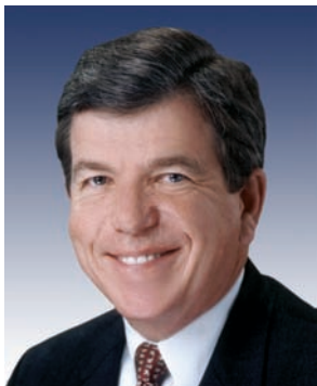
Rep. Roy Blunt of Springfield (7th District) Republican—6 terms