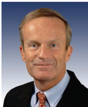
Rep. W. Todd Akin of St. Louis (2d District) Republican—4 terms