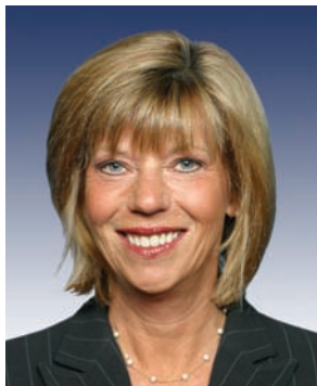
Rep. Jo Ann Emerson of Cape Girardeau (8th District) Republican—7 terms