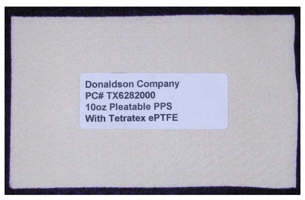
Figure 1. Photograph of Donaldson Company, Inc.'s 6282 Filtration Media