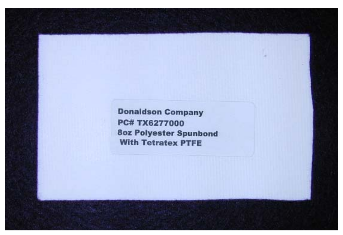
Figure 1. Photograph of Donaldson Company, Inc.'s 6277 filtration media