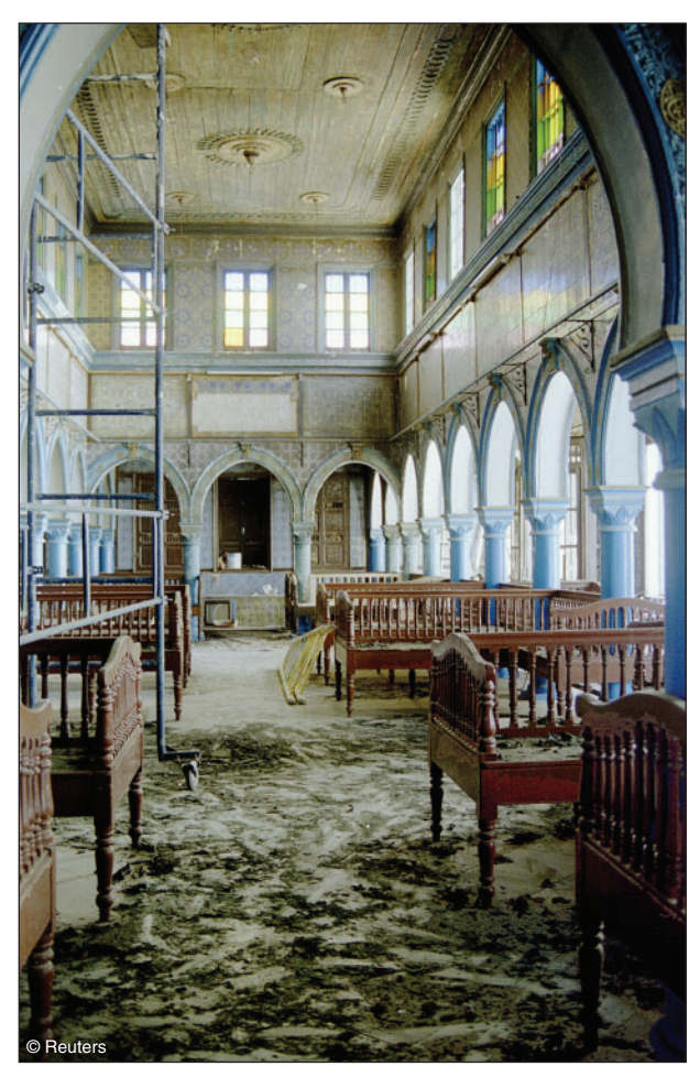
Bomb damage to a Jewish synagogue in Djerba, Tunisia, after terrorists exploded a tanker truck containing cooking gas outside the synagogue, killing 17 persons, 11 April 2002.

2001 agreement with the Algerian Government to strengthen border security, Tunisia continued to respond quickly to counter possible border incursions from Islamic militants in Algeria.