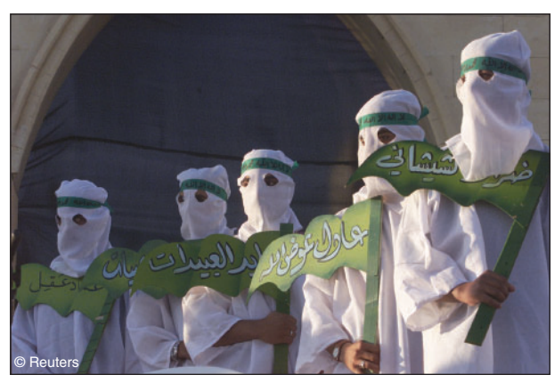
Jordanian Islamists hold banners showing names of Palestinian suicide bombers during a pro-Palestinian rally in Amman, 21 August 2002.

Suspected terrorists continued attempts to exploit Jordanian territory to transit weapons to and from groups in neighboring states, or to use Jordanian territory to facilitate terrorist attacks. Jordanian authorities have successfully intercepted such