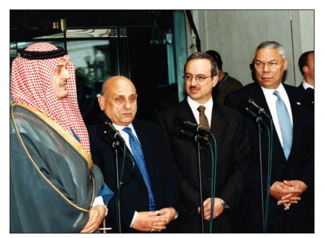
His Royal Highness Prince Saud Al Faisal, Minister of Foreign Affairs of Saudi Arabia; His Excellency Ahmed Maher Al-Sayyed, Minister of Foreign Affairs of the Arab Republic of Egypt; His Excellency Marwan Jamil Al-Muasher, Minister of Foreign Affairs of the Hashemite Kingdom of Jordan; and Secretary of State Colin Powell speak to reporters after their meeting at the State Department, July 2002.

The Egyptian and US Governments continued their close cooperation on a broad range of counterterrorism issues in 2002. The relationship deepened in 2002 as the countries coordinated closely on law-enforcement issues and the freezing of assets, consistent with the requirements of UNSCRs 1373, 1267, 1390 and 1455. Egypt also cooperated with the United States in freezing the assets of individuals and organizations designated by the United States pursuant to Executive Order 13224. In law enforcement, the Egyptian Government deepened its informationsharing relationship in terrorist-related investigations. The Government provided immediate information, for example, in the investigation of the shootings on 4 July at Los Angeles airport, which involved an Egyptian national. Its response was critical in determining that the shooting was an individual act, not part of a terrorist conspiracy. The Egyptian Government also provided the name and full identification (numerical identifiers and photo) of a terrorist believed to be in the United States.