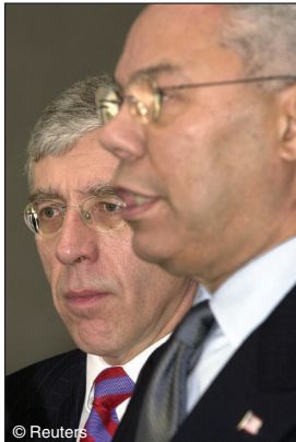
British Foreign Secretary Jack Straw listens to remarks by Secretary of State Colin Powell as they brief the press, 15 October 2002. Both stated that the Bali bombings made them more determined than ever to pursue the war on terrorism.