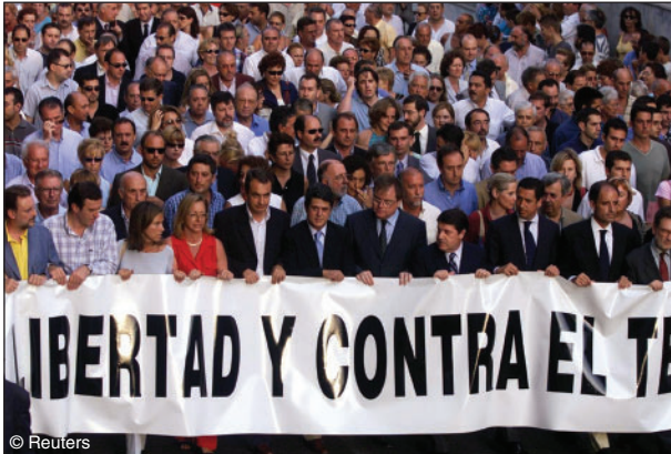
Citizens protest against ETA in Santa Pola, Spain, 6 August 2002, two days after a powerful car bomb killed two persons and injured 45.