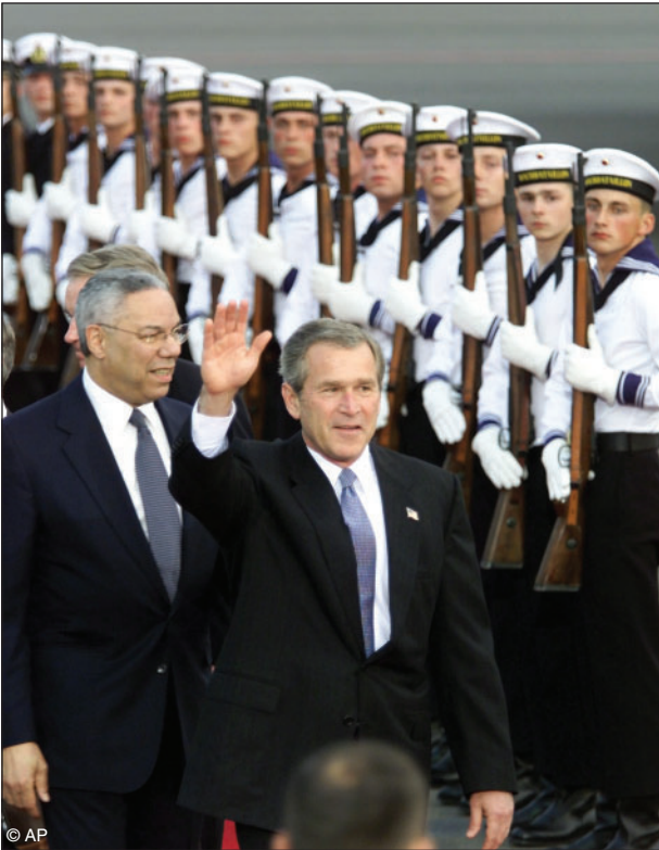
President George W. Bush and Secretary of State Colin Powell walk past honor guards after arriving in Berlin, Germany, 22 May 2002, at the start of a four-nation trip to Europe where Bush told allies, “we’ve got to be tough” in the battle against terrorism.

its new legislation, particularly the strengthened law on associations, to ban violence-prone extremist organizations.