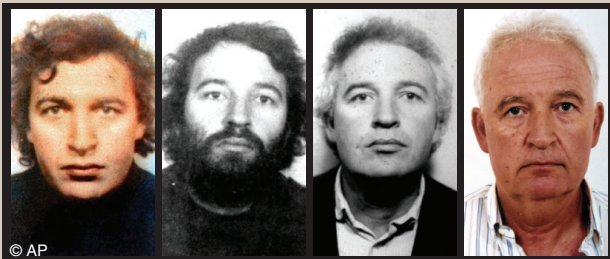
Composite photo of Alexandros Yiotopoulos, the ideological leader of 17 November.

Savvas Xyros, suspected member of 17 November, is escorted by antiterrorist police officers at Korydallos maximum security prison in Athens, 2 September 2002.