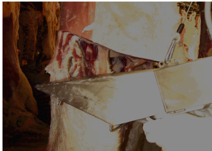
Figure 1. USMARC beef carcass image analysis system for measuring yield grade and marbling score.

A number of packers have expressed interest but we don't know how quickly any of them might move toward adoption of the technology. The distributor of the system is Analytical Spectral Devices, Inc. ( www.asdi.com ).