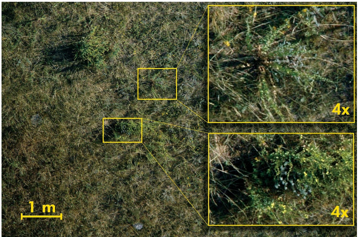
Figure 1. Digital aerial image of mixed-grass prairie containing multiple patches of toadflax. Upper inset shows an individual toadflax plant with 6 stems. Lower inset shows a dense patch of toadflax. Both insets also contain Artemisia frigida Willd. (prairie sagewort), with lighter gray-green foliage.

the entire study area was 0.20\% \pm 0.058 CI ( n = 1987 ). Thus, with sampling intensity similar to that used here, we would expect to be able to detect changes in toadflax cover larger than 0.058% (29% of the mean). Testing how the confidence interval depended on sample size, we found that interval width decreased rapidly until approximately 400 images (making up 0.5% of the study area) were sampled (Fig. 3). Thus, we would expect that capturing a minimum of 400 aerial images in a future flight would allow changes in toadflax cover greater than 0.1% cover (50% of the mean) to be detected.