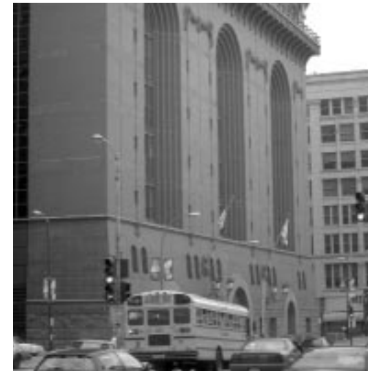
School bus approaches the Chicago Public Library—Where should public investment dollars go?

Reassessments of growth point to a solution based on smart growth—growth that enhances the value and character of existing business and community investments and accommodates growing regional populations. Smart growth acknowledges that new growth not only is necessary, but when done well is also critical to the health of existing neighborhoods. New collaborations between the public and private sectors are aimed at rewarding development that accomplishes this goal. Communities that successfully meet the challenge not only will improve quality of life for their citizens, but will also retain their