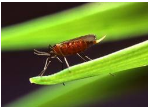
Adult Hessian fly.

Give Those Hessian Fly Pests A Tummy Ache. The Hessian fly is one of the most destructive insect pests of wheat plants. One important method for controlling such pests is to inhibit the activity of their digestive enzymes so that they can not digest their food.