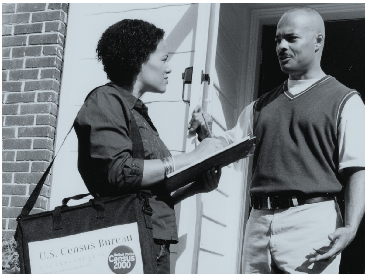
A Census Bureau field representative visits the household.

This cross-sectioning of the housing inventory gives a picture of houses and households as they change over long periods of time.