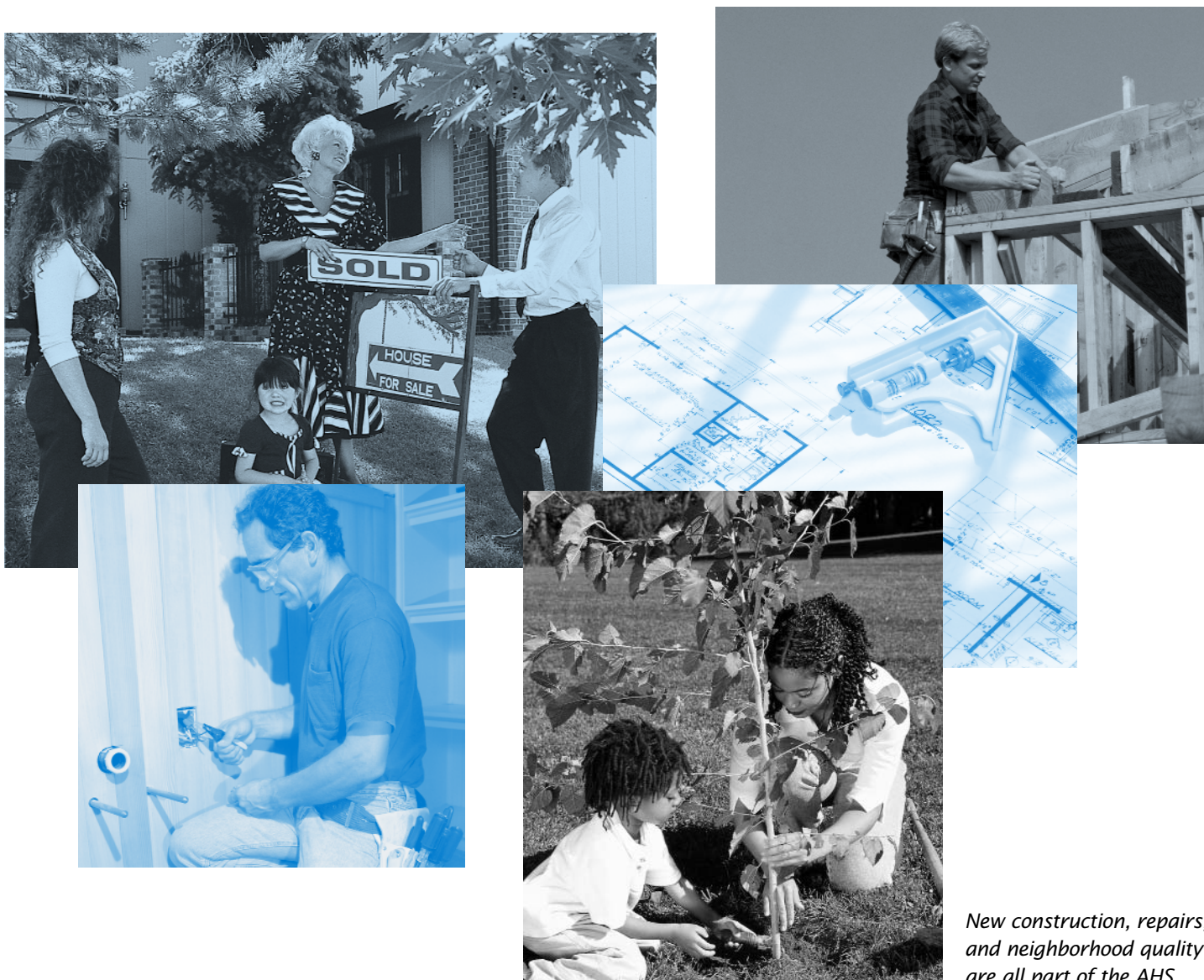
New construction, repairs, and neighborhood quality are all part of the AHS.

For all people, whether adult or child, the AHS provides age, sex, household relationships, education, wages, and the year moved into their home.