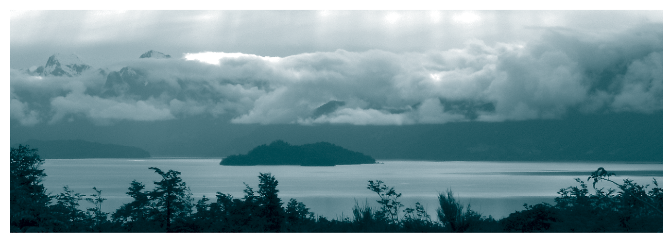
The U.S. Environmental Protection Agency (EPA) Region 10 recently certified the Jamestown S'Klallam Tribe's Watershed Based Plan "Protecting and Restoring the Waters of the Dungeness." Certification was based on compliance with federal tribal nonpoint source program guidelines.

The Jamestown S'Kallam Tribe is the first Native American Tribe in the nation to achieve certification of a watershed based plan. The Tribe is based in Sequim, WA, on the north coast of the Olympic Peninsula.