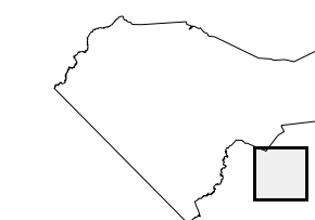
Key to Adjacent Sheets