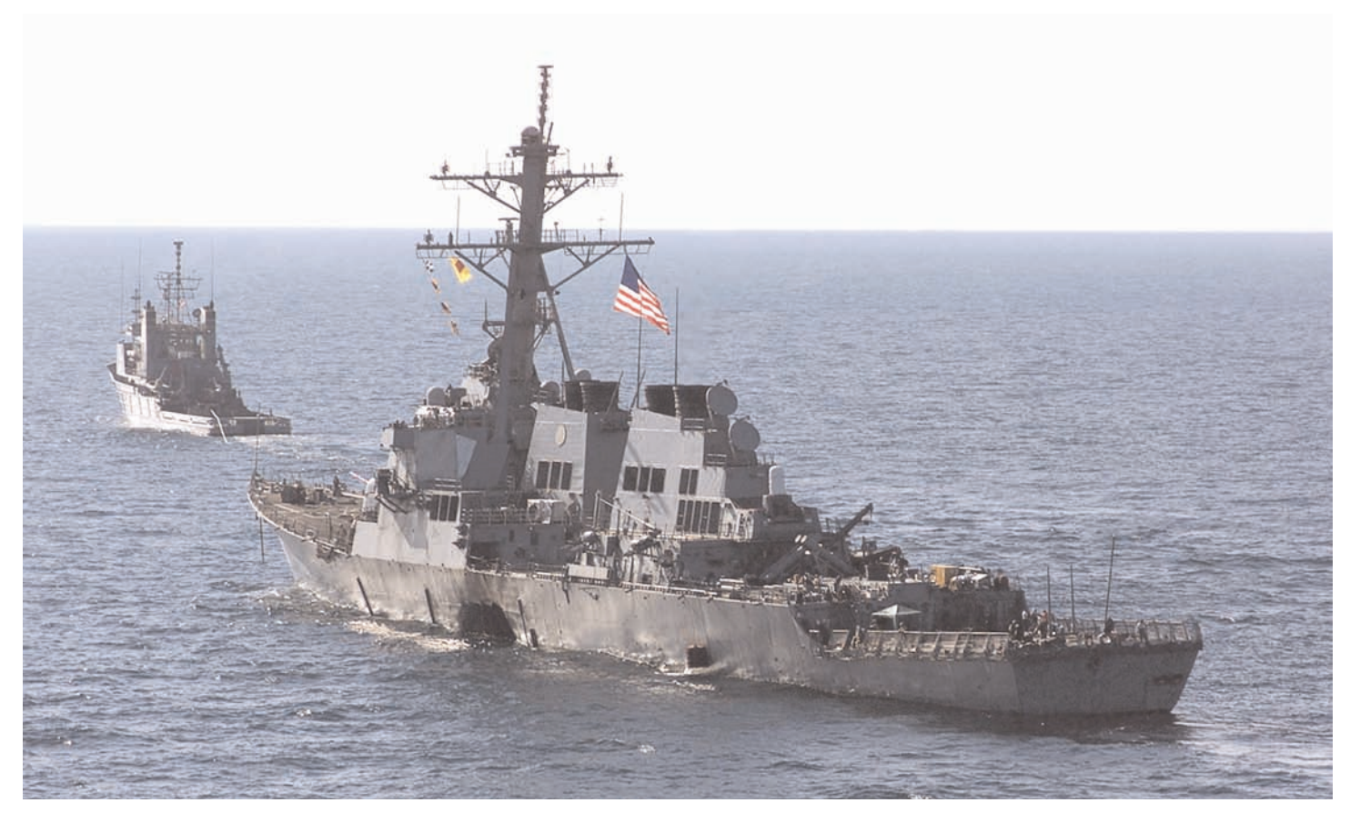
The USS Cole (DDG 67) is towed away from the port city of Aden, Yemen, into open sea by the Military Sealift Command ocean-going tug USNS Catawba (T-ATF 168) on Oct. 29, 2000. Cole will be placed aboard the Norwegian heavy transport ship M/V Blue Marlin and transported back to the United States for repair. The Arleigh Burke class destroyer was the target of a suspected terrorist attack in the port of Aden on Oct. 12, 2000, during a scheduled refueling. The attack killed 17 crew members and injured 39 others.