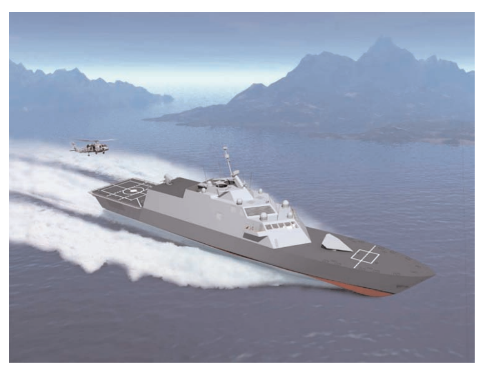
Lockheed Martin Design Littoral Combat Ship (LCS)

The Navy USV master plan calls for the same type of approach. This tack has landed other government programs in hot water because of technical and