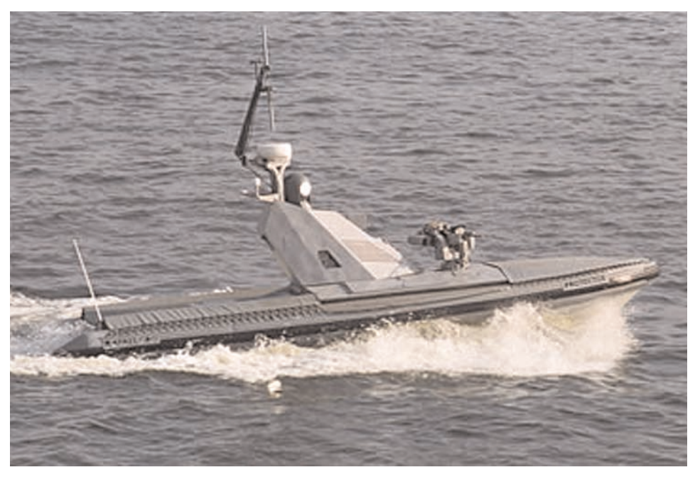
The Protector, manufactured by BAE Systems, Lockheed Martin and Rafael Armament Development Authority, Ltd., is a remote-controlled Unmanned Surface Vehicle (USV) equipped with a stabilized mini-Typhoon weapon system (MK 49 Mod 0), cameras, radar equipment and electro optics.