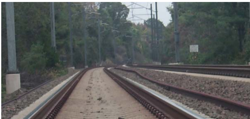
Figure 1. Curve with modified spiral, near Guilford, CT

At the test site, the modified spiral geometry was applied without the need to change rail length. The resulting shape and rate of superelevation change also fall within existing Federal Railroad Administration (FRA) track safety standard allowances. Amtrak plans to continue this study by installing the modified spiral geometry on at least two additional curves for further evaluation.