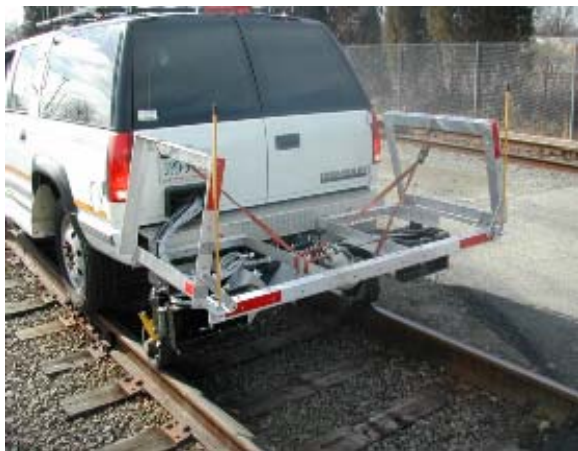
Figure 2. Side sections of instrumentation beam are folded for traveling on highway.

Broken joint bars have been identified as one of the significant causes of main line derailments in the United States. Currently, railroad maintenance personnel visually inspect joint bars during regular track inspection. The quality of this inspection, which is usually performed from a hi-railer, is questionable. Visual inspection of joint bars on foot provides good results; however, inspection on foot is a very slow and labor-intensive process. FRA, supported by ENSCO, Inc., developed and tested an automated video inspection system of joint bars, which operates from a moving vehicle (Figure 2).