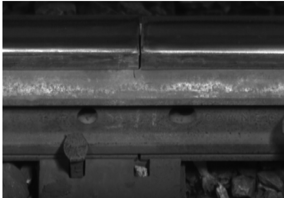
Figure 4. Small center crack detected by joint bar inspection system.

inspected joint bars, the software detected 60 joint bars (or 0.2 percent) as potential cracks. Based on visual analysis of the images, three cracked joint bars were confirmed and reported to the railroad (Figure 4).