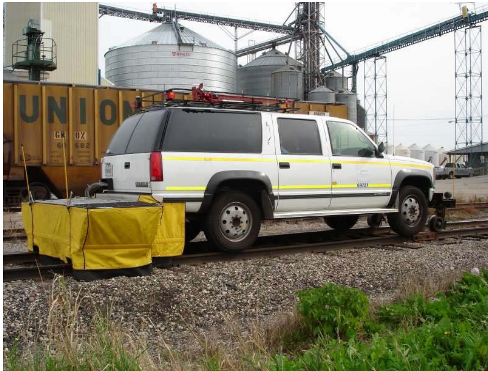
Figure 1. Joint Bar Inspection System is fully deployed and ready for testing.

An automated video inspection system of joint bars has been developed and successfully field evaluated to detect cracked joint bars. The Federal Railroad Administration (FRA), Office of Research and Development, and ENSCO, INC jointly funded this research effort. The system utilizes high-resolution scan line cameras and two joint bar detection laser sensors mounted on a hi-railer (Figure 1). In two field demonstrations, the system detected cracks in joint bars with acceptably low false alarm rates (40 percent of detected cracks were confirmed and 60 percent were rejected by the system operators). Though the system missed 15 percent of the cracks, none of the missed cracks were center cracks. The crack detection algorithm is being refined and tested to reduce the number of missed cracks and false detections caused by high ballasts and vegetation, grease, mud, or other conditions on or near joint bars.