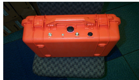
Figure 3. Portable Installation of Vehicle Tracking System Hardware

The VTS communications system allows for the tracking of 5-6 vehicles per second. The backbone for the communications network is a UHF data channel pair operating at 452.475 and 457.475 MHz, respectively, with a 12.5 KHz channel bandwidth.