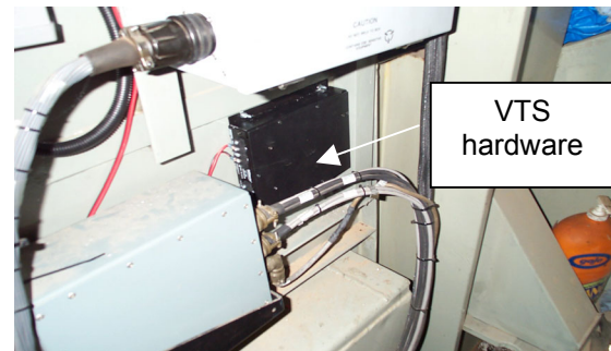
Figure 2. Locomotive Installation of Vehicle Tracking System Hardware

most reliable location reporting. The NDGPS beacon signal is received from a broadcast station at the nearby Pueblo Chemical Depot. The close proximity of the TTC to the Depot results in a reduction in errors from atmospheric variation in the differentially corrected DGPS signal. This means that the final resolved position for each mobile unit is more robust than the 1 – 3 meters accuracy advertised by the U S Coast Guard, the operator of the NDGPS network.