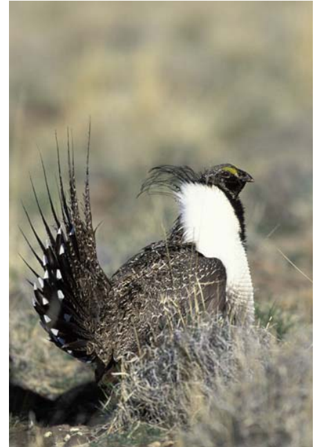
Male greater sage-grouse.

small, open sites often surrounded by denser sagebrush. Males strut with their tails fanned and emit loud "plops" produced by large air sacs on their chests.