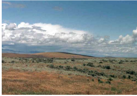
Sagebrush habitat, Yakima Training Center.

Yakima Training Center developed and implemented a greater sage-grouse management plan as part of its INRMP.