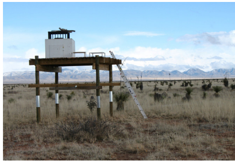
Aplomado falcon hack tower.

populations in the U.S. The intense overgrazing that resulted in shrub encroachment in Chihuahuan Desert grasslands in New Mexico and Arizona has moderated, and there has been widespread implementation of improved range management techniques. In addition, the use of DDT was banned in Mexico in 2000.