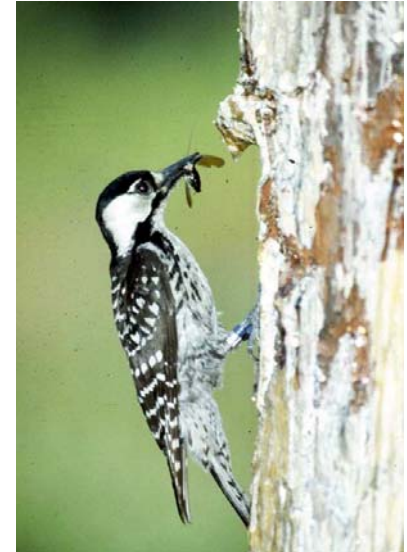
A red-cockaded woodpecker takes an insect back to its nest on Camp Lejeune.

sapwood exudes a sticky resin that coats the surrounding bark. Ultimately, RCWs evolved to make use of this trait by pecking many small “resin wells” into the bark in numerous locations to expose the sapwood and release the flow of resin around the cavity. This coats the tree in a virtually impenetrable barrier of resin which tends to deter most ground predators. RCWs avoid most of the resin by removing the bark to clear a bare “plate” around the cavity, which allows them to enter and exit with minimum exposure to the resin.