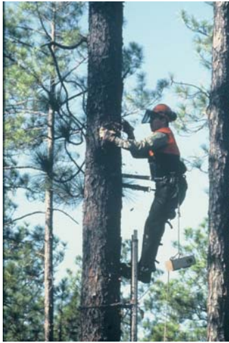
Installing an artificial nest cavity.

At present there are 18 Department of Defense (DoD) installations supporting RCWs. As of 2000, Eglin Air Force Base (FL) had 301 active clusters and Fort Bragg (NC) had 350 (only the Apalachicola Ranger District in Florida had more active clusters than Fort Bragg). All of these populations appear to be stable or increasing. Widespread declines among populations on military installations have been stabilized, but substantial increases in population sizes are still required for recovery. Early in the recovery phase of RCWs, the perception that military activities were a handicap to RCW conservation created tension between national defense requirements and endangered species management. However, RCWs have been shown to be more resilient to man's presence and activities than previously thought. The nature of live-fire and mechanized training in pine forest lands by default fosters the savanna type conditions conducive to RCWs. Studies have shown that