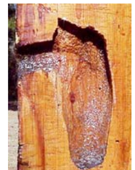
Nest cavity cross-section

RCWs exist in a cooperative social family structure called a “group.” Each group has up to 10 birds but contains no more than 1 breeding pair. Each bird has its own roosting cavity. The collection of individual cavity trees is referred to as a “cluster.” Although the bulk of the RCW’s population occurs in longleaf pine forests, all of the southern pine species harbor RCWs. They forage almost exclusively on arthropods found on pine trees, prying off bark plates to expose prey beneath. Mixed-age stands can harbor birds, but there must be enough older trees, typically 80 years or older, to support active and replacement cavities. Openness is another important stand characteristic. The species depends on almost park-like conditions, where the understory is low, and the midstory is minimal to non-existent. Many other birds are likely to inhabit RCW cavities, from bluebirds and nuthatches to all of the other woodpeckers, and most significantly, flying squirrels.