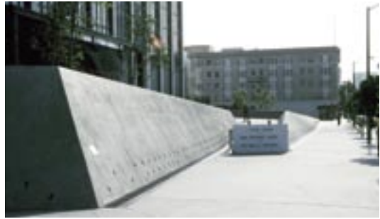
Phillip Burton Federal Building and U.S. Courthouse, San Francisco, CA.