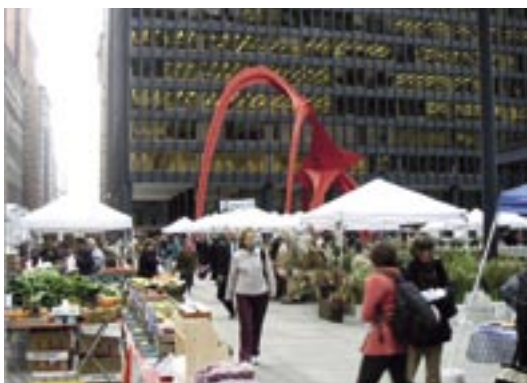
John C. Kluczynski Federal Building, Chicago, IL, before the weekly farmers market (top) and during.