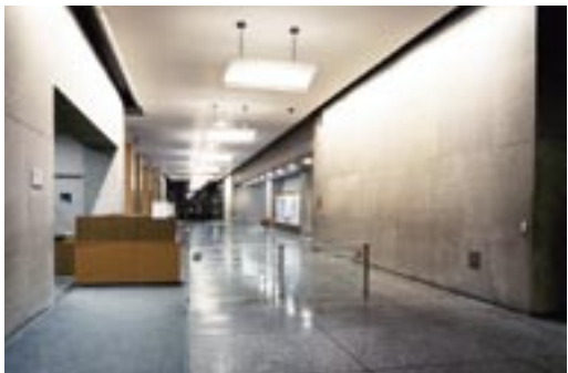
The redesigned lobby of the James A. Byrne U.S. Courthouse, Philadelphia, PA, shown before (top) and after, enhances the visitor experience with improved wayfinding signage and more intuitive circulation.