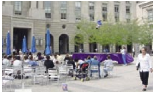
Flexible security arrangements enable Washington DC's Reagan Building to hold hundreds of public events annually.