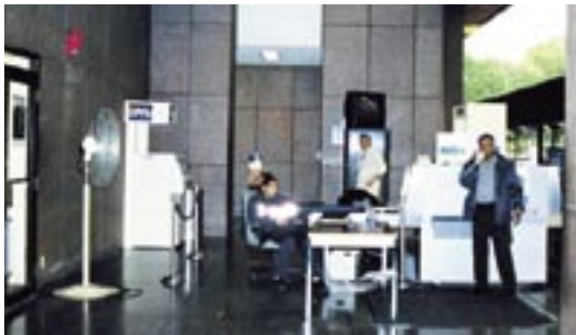
Disorganized interior security not only is inefficient, but can intimidate first-time visitors with its bulk and lack of logical flow.

It's unavoidable: safety and security are of paramount concern in these times. But all too often security "solutions" transform a public building into a cold, forbidding place—a veritable fortress. The barriers can be physical, such as ubiquitous concrete Jersey barriers and unrelenting rows of bollards around the property's perimeter, or a matter of logistics, such as a lengthy, intimidating screening process inside the building. Perhaps even more pervasive are the psychological barriers that arise when a building is secured according to the misguided notion that "no people" equals "no problem." The challenge for building managers is to maintain active and open facilities in a time of enhanced vigilance and heightened fear. Washington, D.C.'s Reagan Building (below, bottom right) is a testament to GSA's ability to overcome the fortress mentality: Not only is it one of the country's highest-profile and highest-security federal buildings, but it is also one of the most active, with hundreds of public events held annually.