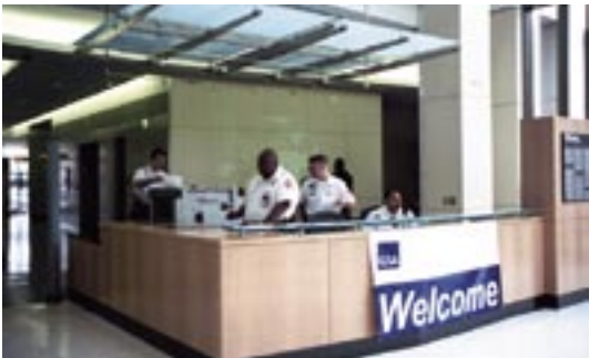
A better solution is to provide a welcoming presence through well-integrated security measures, such as the security desk at the Byron Rogers Federal Building in Denver, CO.