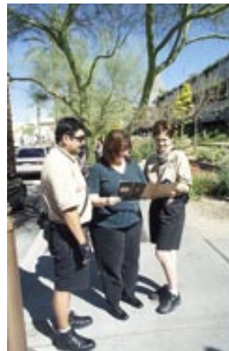
Employees of the Business Improvement District in Phoenix, AZ, review a map of downtown with GSA's building manager.

Engaging partners outside the federal government can be intimidating. GSA staff may be reluctant to reach out to local governments or other agencies because past projects have strained relationships. The desire to go it alone, however, bears very negative consequences for GSA properties. By not collaborating with local authorities on infrastructure improvements or working with neighborhood groups to host programs and events, property managers risk turning federal buildings into islands without connection to surrounding communities. Relationships with local agencies will only deteriorate in this scenario. In fact, communicating with local agencies as early and often as possible on issues of mutual interest is the best way to build healthy partnerships and maximize GSA's positive impact in the communities where we operate.