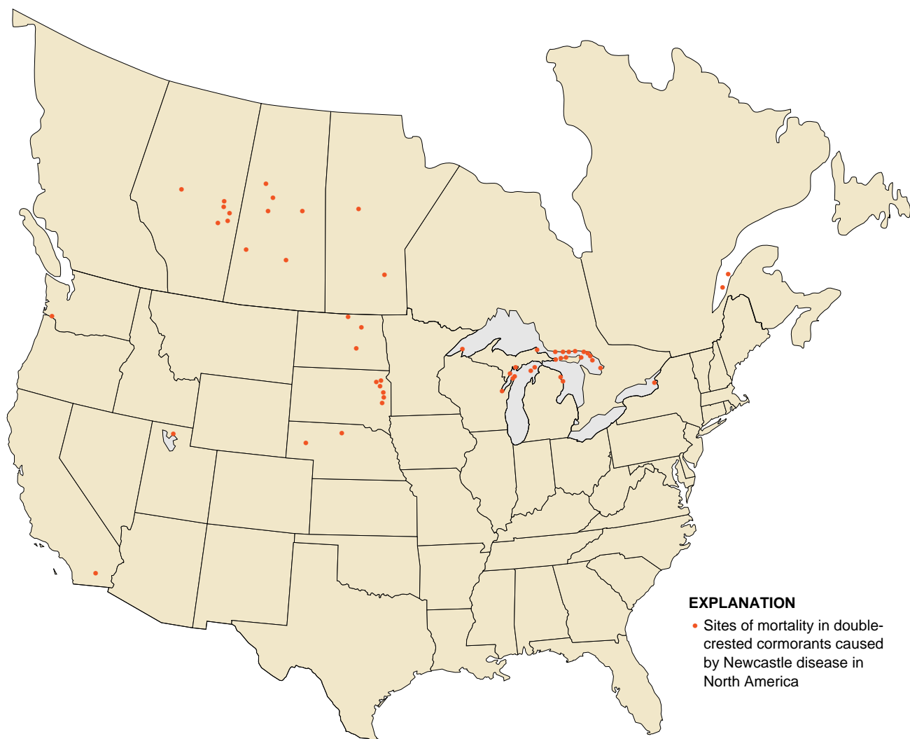
Figure 21.1 Locations in North America where Newcastle disease has caused mortality in double-crested cormorants.

Experimental inoculations in adult mallard ducks with a highly virulent form of NDV from chickens resulted in onset of clinical signs 2 days after inoculation. Initially, mallards would lie on their sternum with their legs slightly extended to the side. As the disease progressed, they were unable to rise when approached and they laid on their sides and exhibited a swimming motion with both legs in vain attempts to escape. Breathing in these birds was both rapid and deep. Other mallards were unable to hold their heads erect. By day 4, torticollis and wing droop began to appear, followed by paralysis of one or both legs (Fig. 21.4). Muscular tremors also became increasingly noticeable at this time.