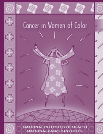
Cancer in Women of Color Monograph

MEDLINEplus has extensive information from the National Institutes of Health and other trusted sources on over 600 diseases and conditions. There are also lists of hospitals and physicians, a medical encyclopedia and a medical dictionary, health information in Spanish, extensive information on prescription and nonprescription drugs, health information from the media and links to thousands of clinical trials.