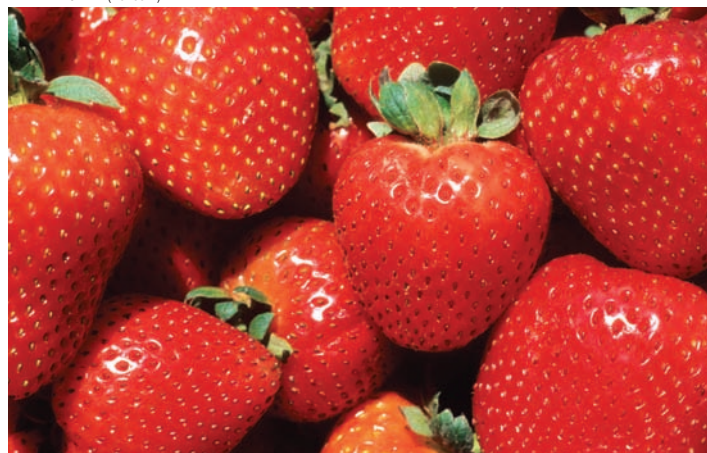
Strawberries and other familiar fruits—and some vegetables—contain natural phytochemicals that can destroy leukemia cells.