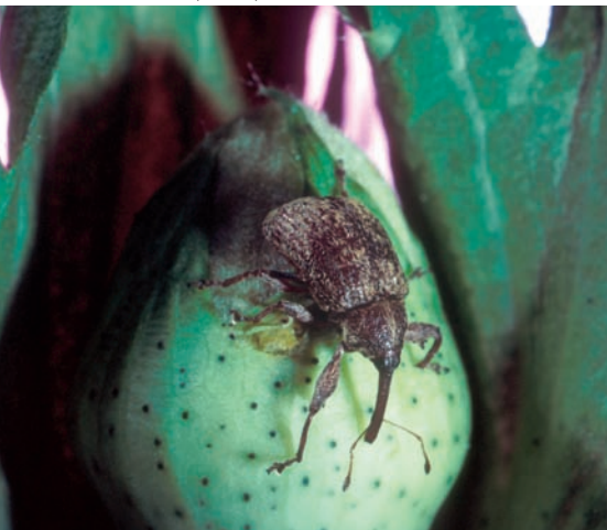
Boll weevil, Anthonomus grandis , on a young cotton boll.