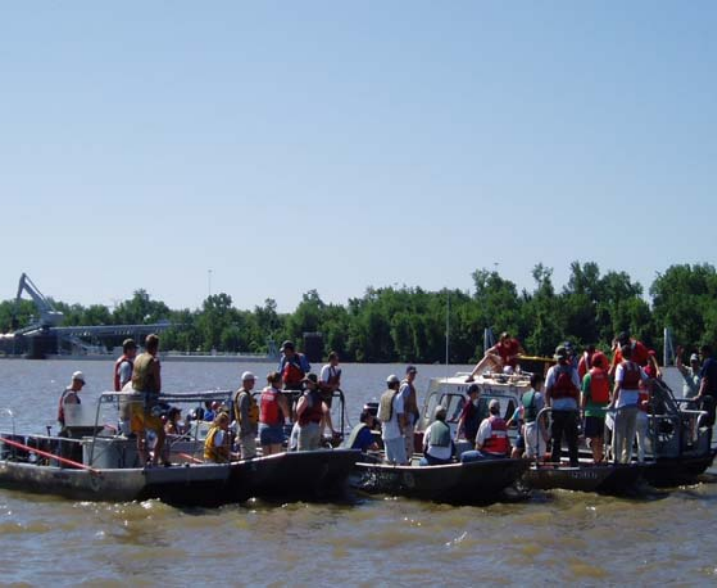
A flotilla of training in pool 26 (Alton, IL) on the Mississippi River in 2005.