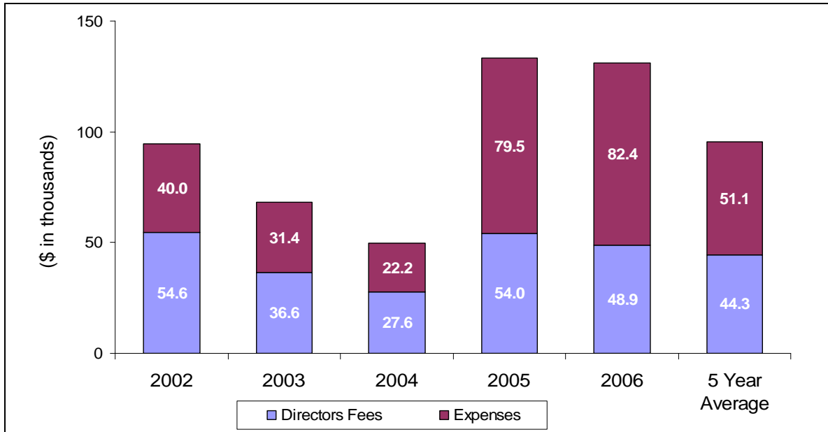
Figure 2. Amtrak Board Expenses by Type (2002 – 2006)

According to the Board’s Statement of Policy, board members 8 receive a $600 Director’s fee for participating in a regularly scheduled Board meeting, a $500 fee for participating in Amtrak-related duties (not including attendance at a regularly scheduled Board meeting) 9 if such performance exceeds 3 hours, and a $250 fee for performance of duties if such performance is 3 hours or less. Board members also are reimbursed for travel expenses related to board meetings and their performance of duties and for other reasonable expenses (such as photocopies, postage, etc.) incurred in connection with the performance of their duties.