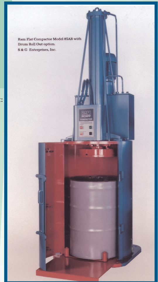
Ram Flat Compactor Model 85AR with Drum Roll Out option. S & G Enterprises, Inc.