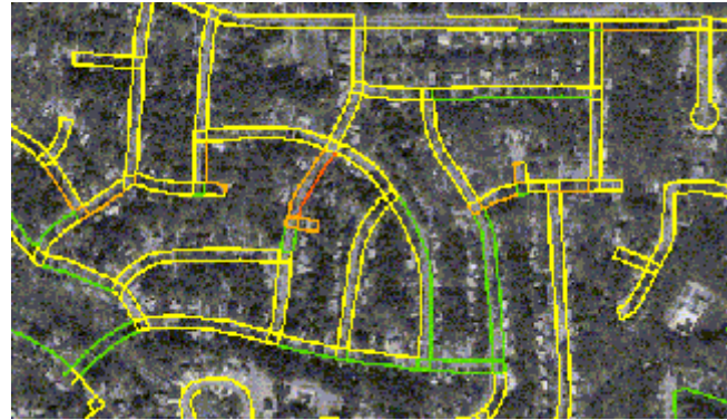
Figure 2. Color coded map indicating the compatibility of each street link for bike riding.