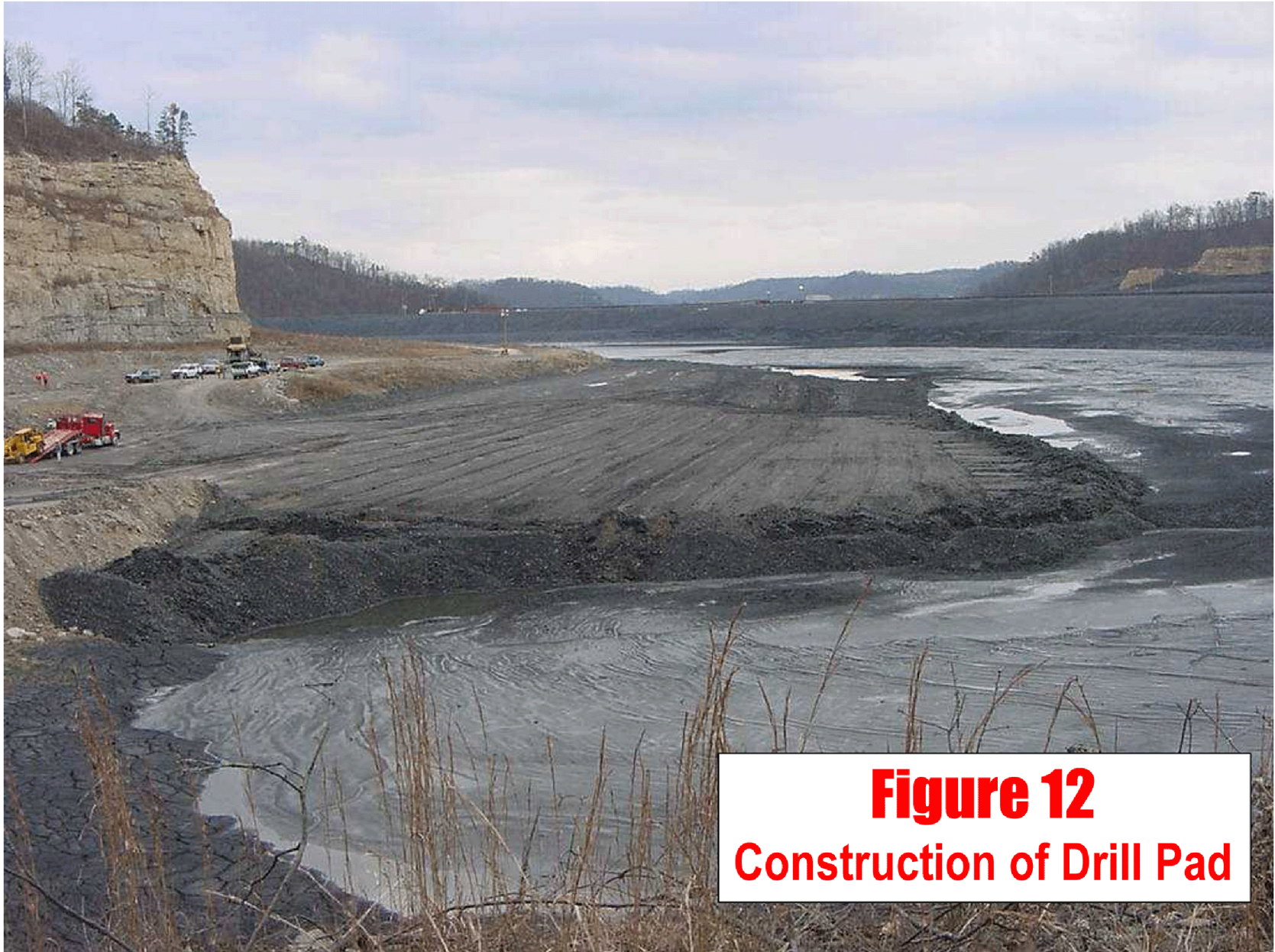
Figure 12 Construction of Drill Pad