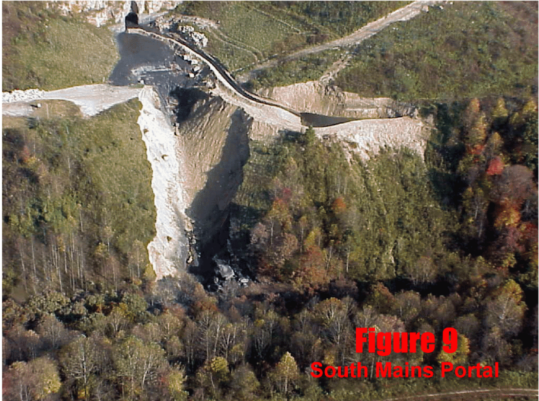
Figure 9 South Mains Portal