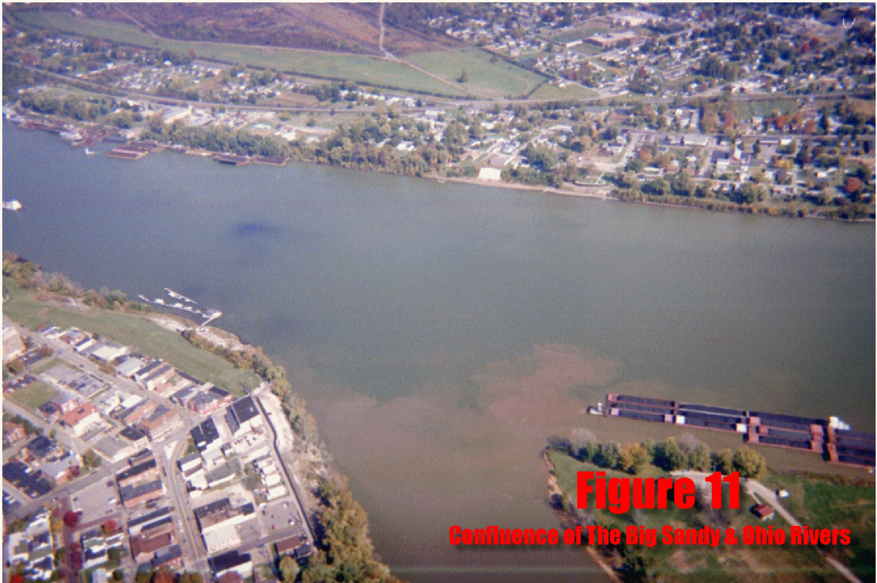
Figure 11 Confluence of The Big Sandy & Ohio Rivers