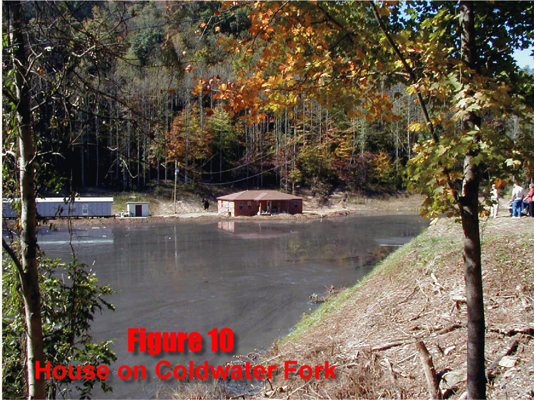
Figure 10 House on Coldwater Fork