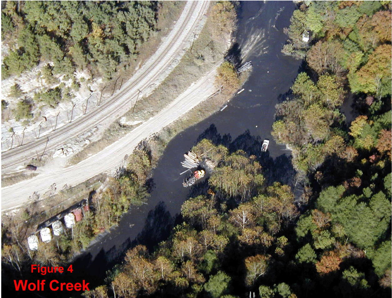
Figure 4 Wolf Creek