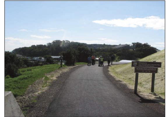
Marshland Road, Don Edwards National Wildlife Refuge, California

Marshlands Roads, Don Edwards National Wildlife Refuge, California. The project required the coordination of four agencies—FWS, Central Federal Lands Highway Division, CalTrans, and the East Bay Regional Parks District—and funding from both the Refuge Roads Program and Transportation Enhancements. The end results included a rehabilitated, rerouted, and widened entry road and overflow parking area; a wider and safer parking lot for Refuge staff and visitors; improved access to the Refuge's popular Environmental Education area; a safer, more efficient entrance to the Refuge's maintenance area and volunteer residences; and a class one bike trail connecting the Refuge over a highway toll plaza with Coyote Hills Regional Park. Over four years of hard work culminated in a functional and attractive project that was well received by the staff and Refuge visitors.