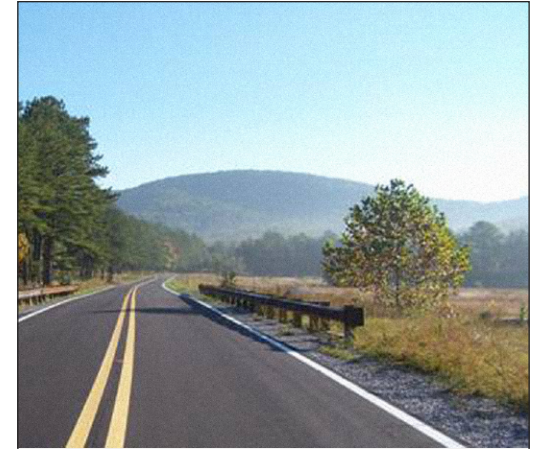
Bain's Gap Road, Mountain Longleaf National Wildlife Refuge, Alabama

parking lots, six transit systems, and over 680 miles of foot trails and boardwalks. The NWRS includes approximately 548 wildlife refuges in all 50 states, Puerto Rico, Guam and the Virgin Islands. The 2005 Safe, Accountable, Flexible, Efficient Transportation Equity Act: A Legacy for Users (SAFETEA-LU) authorized the RR Program at $29 million per year through 2009. Funding is provided for the design, reconstruction, maintenance or improvement of Refuge Roads, and SAFETEA-LU expanded the scope of the program to include interpretive signage and trails.