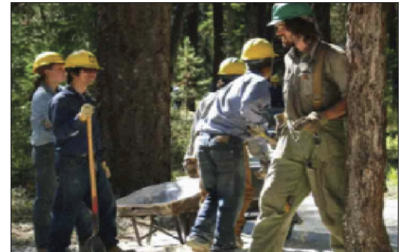
A new parking area greets visitors at Little Pend Oreille's restored McMEET Trail, Washington

Little Pend Oreille National Wildlife Refuge, Washington. Western Federal Lands Highway Division and FWS are performing several transportation facility improvements within the Little Pend Oreille National Wildlife Refuge. Work is currently in its initial stage, which will culminate in late 2008. Improvements are needed to provide continued safe, convenient access for commercial, recreational, and maintenance traffic using Refuge Roads. The routes have uneven surfaces and are single-lane, containing long stretches with no formal turnouts. Proposed work includes rehabilitating approximately 13 miles of gravel roads, improving and adding turnouts, rehabilitating the River Camp Bridge, upgrading parking areas, repairing culverts, and drainage maintenance.