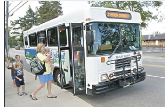
Island Explorer Transit System

WFLHD contributed $500,000 to help purchase the 179-acre (72.4-hectare) Whalen Island and save it from development. The preservation of Whalen Island and the Sand Lake Estuary keeps intact an undeveloped estuary along the state's coast. The WFLHD contribution prevented it from being purchased by a developer and expedited a project to improve Oregon Forest Highway 164 by helping to offset the unavoidable filling of 5 acres of wetlands.