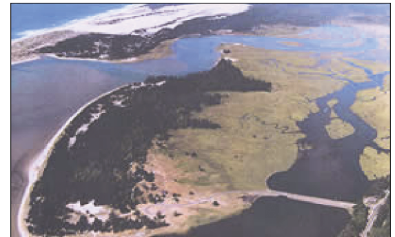
Whalen Island, Oregon