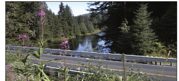
Tongass National Forest, Alaska (Forest Highways)