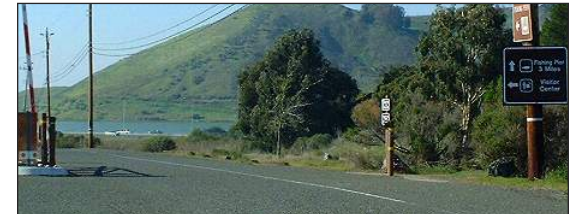
Don Edwards San Francisco Bay National Wildlife Refuge, California (Refuge Roads)