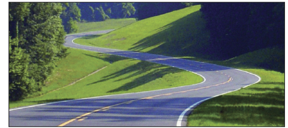
Natchez Trace Parkway, Mississippi (Park Roads)