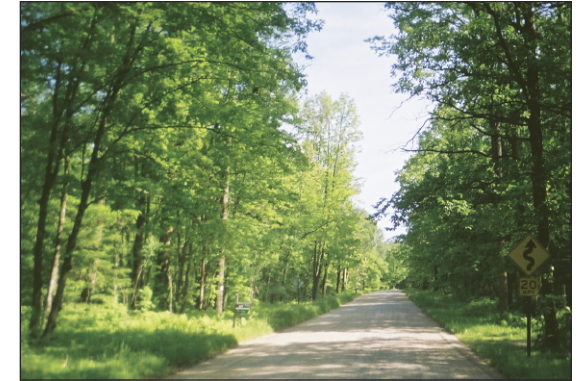
Minnesota Forest Highway 22 through the Chippewa National Forest

The 2005 Safe, Accountable, Flexible, Efficient Transportation Equity Act: A Legacy for Users (SAFETEA-LU) authorized $940 million for FH for FY05-09.