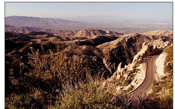
General Hitchcock Highway