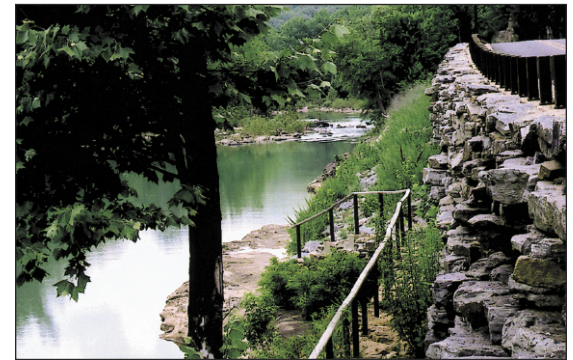
Arkansas Forest Highway 65