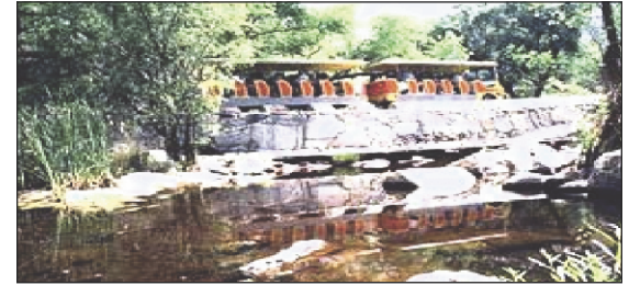
Sabino Canyon Tram, Coronado National Forest

Shiloh Marsh Road. Located along Florida's east central coast, Merritt Island National Wildlife Refuge overlays the National Aeronautics and Space Administration's John F. Kennedy Space Center. Shiloh Marsh Road (11.6 miles), a dike road in the refuge, was being rehabilitated by Eastern Federal Lands Highway Division when Hurricane Charley caused extensive damage. The storm surge caused the water level to rise more than 5 feet, washing away whole sections of the dike and much of the new road material. With the use of funds from the ERFO program, the road was repaired and reopened after an extended 2 ½ year closure. The project also included the rehabilitation of Cruickshank Trail (0.3 miles) and the rehabilitation of Bairs Cove Parking Area.