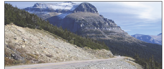
Going to the Sun Road, Glacier National Park