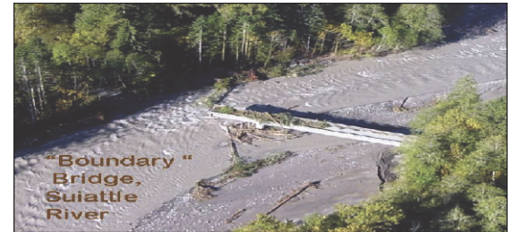
Boundary Bridge after flooding, Mt. Baker — Snoqualmie National Forest