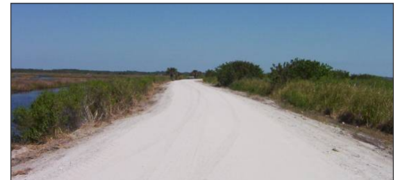
Shiloh Marsh Road, Merritt Island National Wildlife Refuge