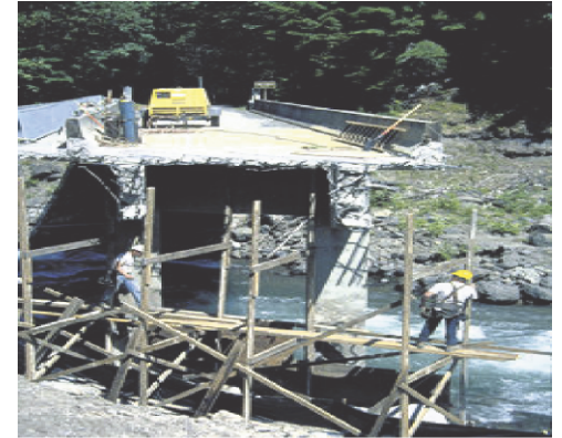
ERFO is funding repairs to this bridge over Iron Creek in Gifford Pinchot National Forest in Washington after it was devastated by a flood.

The following categories of roads are eligible for ERFO funding: Forest Highways, Forest Development Roads, Park Roads and Parkways, Indian Reservation Roads, Public Lands Highways, Refuge Roads, Military Installation Roads, Corps Recreation Roads, Bureau of Reclamation Roads, Bureau of Land Management Roads.