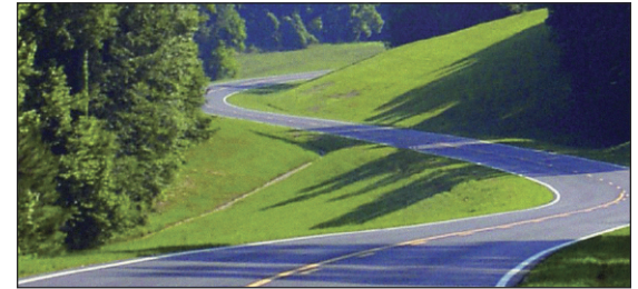
Natchez Trace Parkway

Foothills Parkway. The National Park Service has been working in partnership with Eastern Federal Lands to construct the 72 mile Foothills Parkway, which traverses the northern and western perimeter of Great Smoky Mountains National Park in Tennessee, since the 1960s. Construction of the parkway began in 1960, with the majority of work, in 3 sections totaling 23.4 miles, completed by 1970. Currently, the emphasis is on the completion of a 16.1 mile section, in a topographically difficult area, including a number of bridges. The parkway will provide millions of tourists with breathtaking vistas of the mountains.