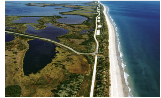
Canaveral National Seashore

Highway system roads, National Park Roads and Parkways, Refuge Roads, Indian Reservation Roads, Defense Access Roads, and other Federal lands roads. EFLHD also provides training, technical assistance, environmental support, planning and asset management, technology deployment, and engineering services to deliver programs, projects, products, and services to other partners and customers.