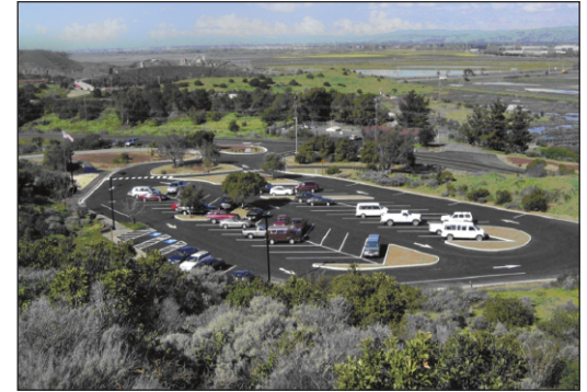
Don Edwards National Wildlife Refuge, California

construction of Forest Highway system roads, National Park Roads and Parkways, Refuge Roads, Indian Reservation Roads, Defense Access Roads, and other Federal lands roads. CFLHD also provides training, technical assistance, environmental support, planning and asset management, technology deployment, and engineering services to deliver programs, projects, products, and services to other partners and customers.