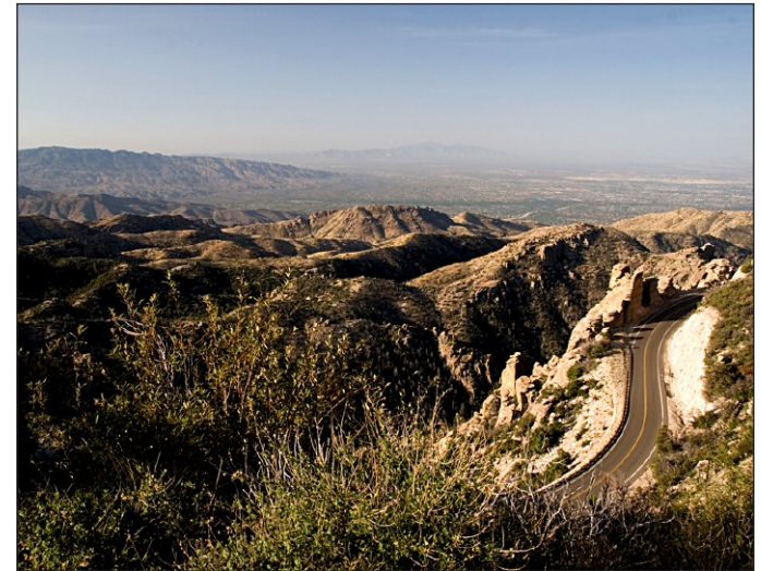
General Hitchcock Highway

Saddle Road. In 1991, planning began for the reconstruction of a 48.5 mile portion of the Ala Mauna Saddle Road (HI State/County Route 200), which connects Hilo to Waimea on the Big Island of Hawaii. Saddle Road, the most direct route between the east and west sides of the island, has one of the highest accident rates of any road of its classification in Hawaii. The Saddle Road improvement project will make the road safer and easier to use by eliminating narrow lanes, improving lines of sight, eliminating numerous roadside hazards such as bridge parapets and rough road edges. The Hawaii Department of Transportation requested that CFLHD be the lead agency for project development and construction of the Saddle Road improvement project. Nearly $80 million in contracts have been awarded for the first three phases of the project. Construction funding for the Saddle Road improvements have been made available from multiple Federal Lands Highway Program sources. Construction of the remainder of the Saddle Road project will be phased as funds become available.