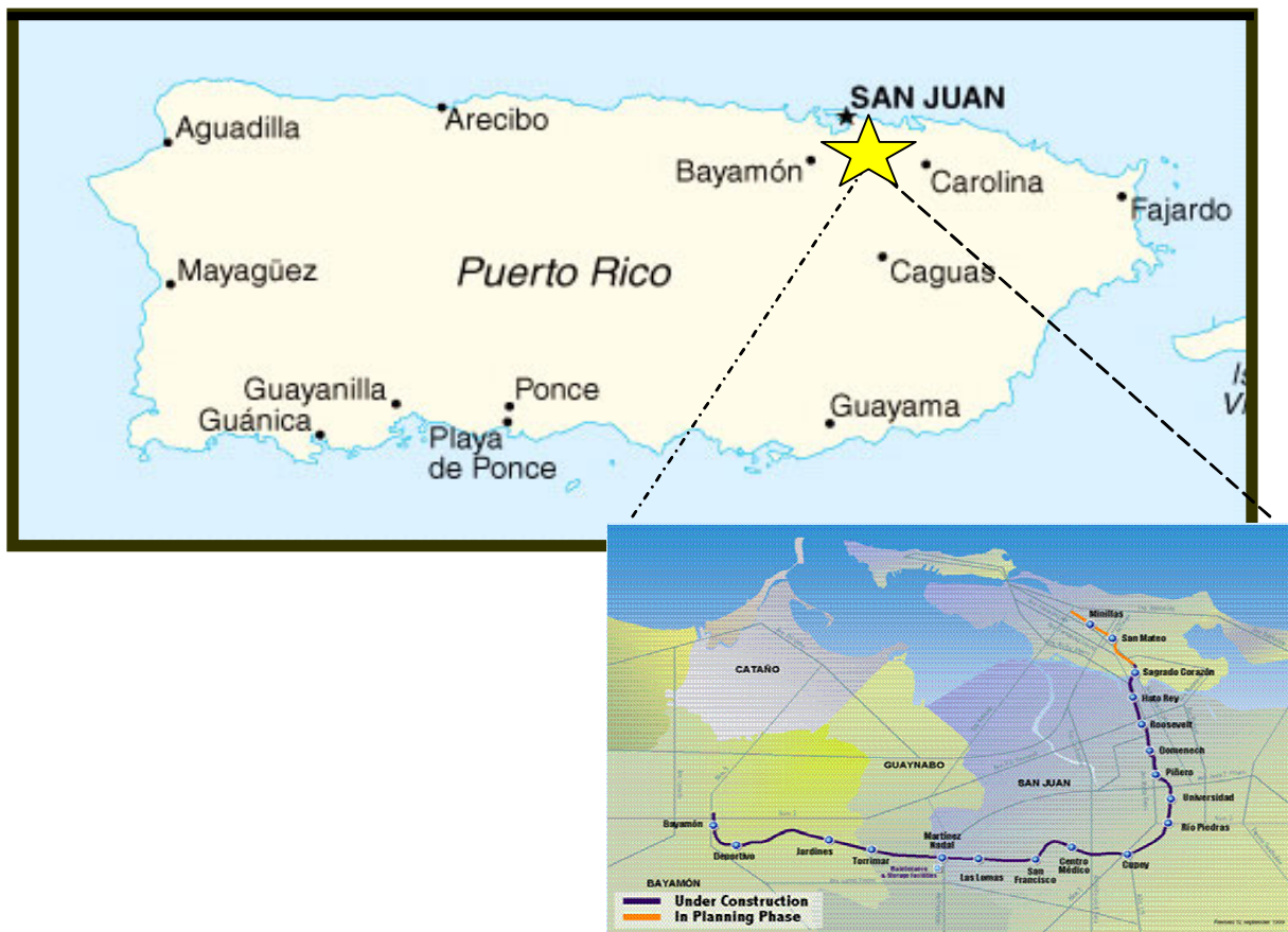
Figure 1. Map of the Tren Urbano Rail Transit Project in the San Juan, Puerto Rico, Metropolitan Area