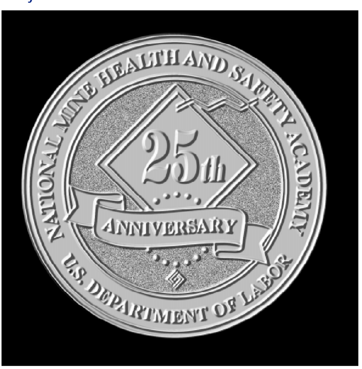
25th Anniversay Celebration August 14, 2001 10:30 a.m.

National Mine Health and Safety Academy 1304 Airport Road Beaver, West Virginia