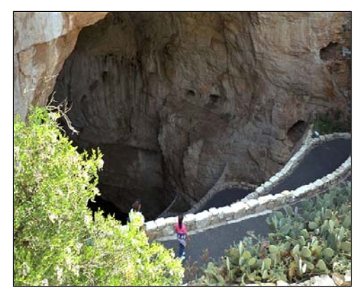
Carlsbad Caverns National Park, New Mexico

At Gettysburg off-road parking at some of the more popular stops along the auto tour such as