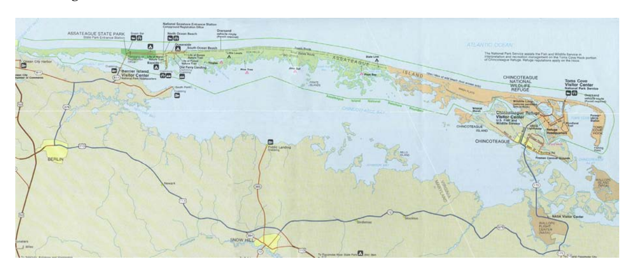
Assateague Island National Seashore/Chincoteague National Wildlife Refuge and Maryland Eastern Shore

planning activities. Increased participation comes out of a desire to preserve and protect the resource, but also to create a positive relationship with the local community. With limited funds available to maintain Federal lands sites and to service a growing number visitors, partnerships are being emphasized. Close working relationships with local and State agencies, as well as the private sector and private non-profit support organizations ("Friends" groups) are essential for most site managers. Many have been working closely to promote "eco-tourism" and other activities that are compatible with agency and site mission statements. Assateague Island National Seashore, for example, spearheaded the formation of a coalition to encourage eco-tourism through development of trail systems that link the lightly-visited inland areas of Maryland's Eastern Shore with the beach. An important objective of this effort was to maintain the rural character of the area, while attracting an increased share of tourist dollars.