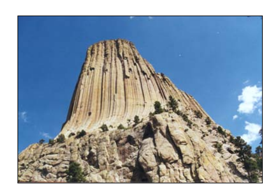
Devil's Tower National Monument, Wyoming

While some communities do not currently believe that there are benefits from transit, others are working with sites to relocate Visitor Centers to their communities, and to implement transit to shuttle visitors to the site. These proposals have the dual objective of promoting visitation and economic development in the gateway community, while helping to preserve and protect site resources. Transit is an important component of proposed changes at sites such as Little Bighorn National Battlefield, Parker River NWR, Devil's Tower NM, and Oregon Caves NM.