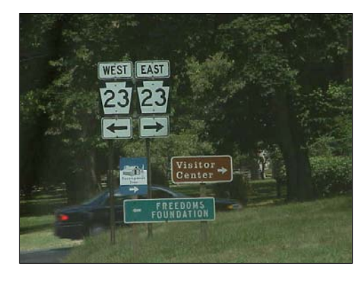
Major Commuter Route, Valley Forge National Historic Park, Pennsylvania

Suburban development is occurring around many of these sites, increasing pressure to use site roads as commuter routes. Valley Forge, Richmond, and Fredericksburg/Spotsylvania are among the sites that are experiencing these pressures. Preservation of other historic sites is often not compatible with widened roadways and larger parking areas. Harpers Ferry, San Antonio Missions, Natchez, and Marsh-Billings-Rockefeller are among the National Historic sites and parks that have implemented transit or are considering doing so in order to avoid additional parking that will detract from the character of the site.