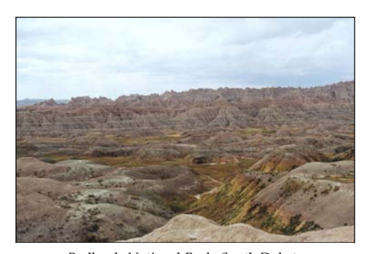
Badlands National Park, South Dakota

The NPS identified a total of 169 sites that may have some ATS need, and identified a sample of 47 for site visits. Telephone calls were made to most of the other 122 sites, although day trips, or "minivisits" were made to 15 sites that were located near consultant team offices. Visits were made to all of