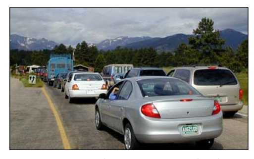
Entrance to Rocky Mountain National Park, Colorado

The goals of the three FLMAs related to recreation and quality of visitor experience cannot be achieved with congested roadways and overcrowded parking areas. In most sites, expansion of roadway and/or parking capacity is not an acceptable solution to transportation problems because of limited funding, unacceptable additional impact to resources, or both.