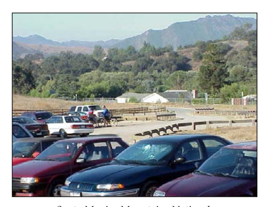
Santa Monica Mountains National Recreation Area, California

Many suburban sites are not well-served by existing transit, but could be served with route extensions or new routes operated by local transit authorities. Santa Monica Mountains NRA, Cuyahoga Valley NRA, and the Chattahoochee NRA in Georgia are three recreational areas that are located close to existing transit systems but have little or no direct service. All are considering plans that would bring additional transit services to their site. Services would not only allow transit-dependent persons to take advantage of these resources, but would help to spread demand from heavily-used areas into more lightly used ones. A number of rural transit properties have success-