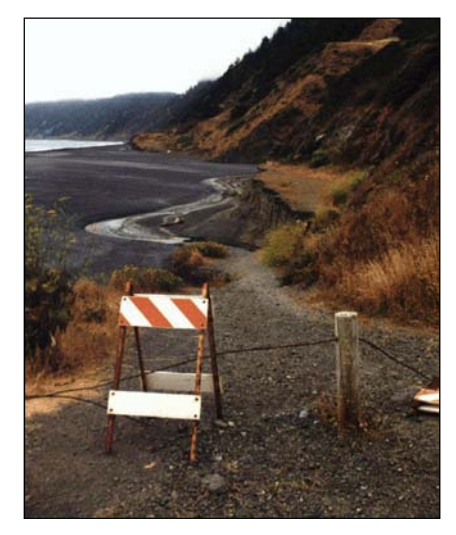
King Range National Conservation Area, California

Transit was frequently identified by site managers as a tool that could be used to improve recreational opportunities for visitors. In many cases, recreational needs