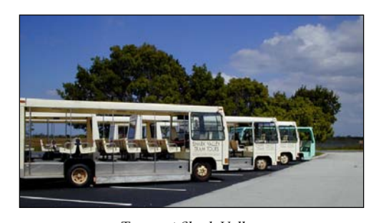
Trams at Shark Valley, Everglades National Park, Florida

Volume I identifies existing and emerging transit technologies appropriate for application on Federal lands. The consultant team utilized as a basis for this work the NPS 1994 Alternative Transportation Modes Feasibility Study: Visitor Transportation System Alternatives. Work included reviewing the alternative transportation modes described in the NPS study and updating the information as necessary. New emerging technologies including alternative fueled vehicles were incorporated, and economic data were updated. The consultant team sponsored