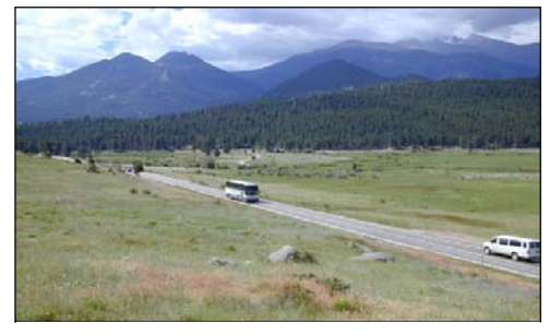
Rocky Mountain National Park, Colorado