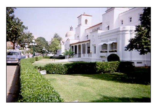
Hot Springs National Park, Arkansas

The difficult challenges of community and economic development have encouraged site managers to become more active in local community