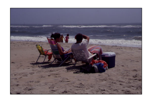
Assateague Island National Seashore, Maryland

At other sites, however, there has been less support for transit system implementation. Local residents in Chincoteague, Virginia (Chincoteague NWR and Assateague NS) are currently working with the support of the FHWA, the FTA, and the Virginia DOT to develop a transit system that will be acceptable