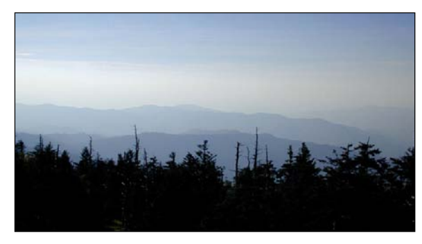
Great Smoky Mountains National Park Tennessee and North Carolina

The NPS, the BLM, and the USFWS have long had complex relationships with nearby communities that are economically dependent on Federal lands. The BLM manages a number of activities, including mining and grazing, that provide a livelihood to many residents of the Western states. The USFWS hosts uses such as hunting and fishing that provide subsistence for local residents and, in some locations, attract economic activity from visitors. One of the missions of the