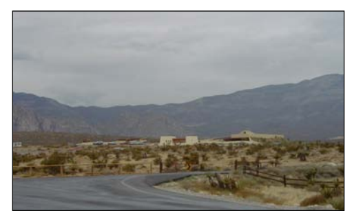
Red Rock Canyon National Conservation Area, Nevada

The mission of the Bureau of Land Management is "to sustain the health, diversity and productivity of the public lands for the use and enjoyment of present and future generations." The BLM's holdings of over 270 million acres constitute one-eighth of the U.S. land area and are located primarily in the western states. Today's BLM was formed in 1946 through a merger of two established agencies: 1) the General Land Office that was formed in the early 1800s to survey and oversee the disposition of Federal lands; and 2) the U.S. Grazing Service, which was formed in