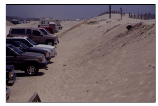
Chincoteague National Wildlife Refuge, Virginia

Virginia includes a heavily visited beach area (operated by the Assateague NS of the NPS) that is subject to frequent storms. The parking area has been either totally or partially destroyed five times in the last 20 years. Due to proximity of wetlands and wildlife habitat, it may be impossible to restore the current number of parking spaces in the future. The NPS and the USFWS are working together with the local community to identify an ATS solution that can be put in place if a large