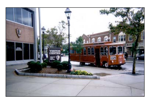
Trolley, Adams National Historic Site, Massachusetts

between the Visitor Center, the Adams Birthplaces, and the "Old House" where four generations of the family lived. The service has transportation benefits in that it relieves visitors from having to negotiate a difficult street pattern and find scarce parking spaces. It also enables park personnel to tell the family story in a logical, sequential manner. At the Manitou Islands in the Sleeping Bear Dunes NL, park rangers ride boats to the islands and use the opportunity to educate visitors about the sensitivity of the island environment.