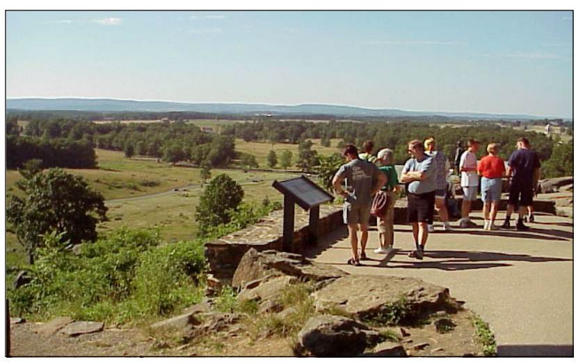
Little Round Top, Gettysburg National Military Park, Pennsylvania