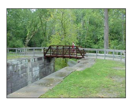
Multi-use Trail, Cuyahoga National Recreation Area, Ohio

At many sites, popular trails have capacity to accommodate more recreational users; however parking at trailheads is often limited. National Recreation Areas located near major urban centers are used regularly by local residents for walking, running, or bicycling. Areas such as the Cuyahoga Valley NRA in Ohio, the Chattahoochee NRA in Georgia, and the Santa Monica NRA in California are all located near major transit systems, but have limited transit access. At the Chattahoochee NRA, a need was identified for shuttle services from nearby office buildings to serve workers wishing to use the park after hours or on weekends. This would make use of available parking and reduce the need to expand parking areas in the NRA.