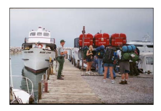
Manitou Island Transit Ferry Terminal Leland, Michigan

Many sites included in the study could not be reached by most visitors without transit service. These include water-oriented sites such as the Channel Islands NP, Boston Harbor Islands National Recreational Area (NRA), Statue of Liberty/Ellis Island NM, the USS Arizona Memorial, and the Manitou Islands in the Sleeping Bear Dunes National Lakeshore (NL). All of these sites have either addressed, or are in the process of addressing, perceived deficiencies in their existing water transportation service. In addition to the major investment required in equipment, piers, and docking facilities, water-oriented sites often have limited landside parking.