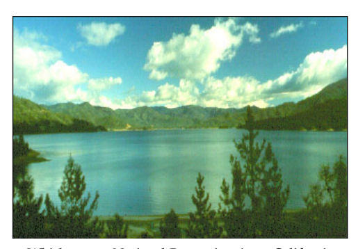
Whiskeytown National Recreation Area, California

transit on Federal lands, and a summary of existing NPS transit services. Section 3.0 includes a summary of issues that can be addressed by transit implementation. These include transportation, resource preservation, economic and community development, recreational, and tribal issues. Section 4.0 includes a description of transit needs identified in the study. Section 5.0 includes a discussion of opportunities for raising revenue to support transit systems. Section 6.0 summarizes the transit needs identified in this volume of the Federal Lands Alternative Transportation Systems Study.