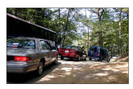
Cades Cove, Great Smoky Mountains National Park, Tennessee

Increased levels of automobile traffic are causing parking problems and congestion that can detract severely from the visitor experience. Visitors travelling to some of the more heavily visited national parks such as the Grand Canyon, Rocky Mountain, Great Smoky Mountains, Acadia, and