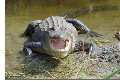
Morgan Brake National Wildlife Refuge, Mississippi

While the major responsibilities of USFWS revolve around protection and management of fish and wildlife, refuges also offer a wide range of recreational and educational opportunities. These include visitor centers, wildlife trails, environmental education programs, and fishing and hunting programs. An estimated 34 million people annually participate in recreational opportunities on USFWS sites.