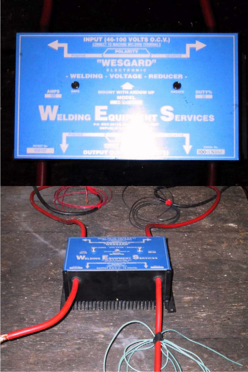
WESGARD 400AC/DC welding voltage reducer

The WESGARD 400AC/DC welding voltage reducer is a secondary, solid-state device connected to both legs of the welder output. It is designed to operate on any constant current welding machine (stick welder) with an OCV of 45 to 100 volts AC or DC. Until the arc is struck, the output voltage is maintained under 12 volts, in order to prevent the operator from receiving a shock. This unit also holds full output voltage for three seconds in order to establish the arc and facilitate stitch welding.