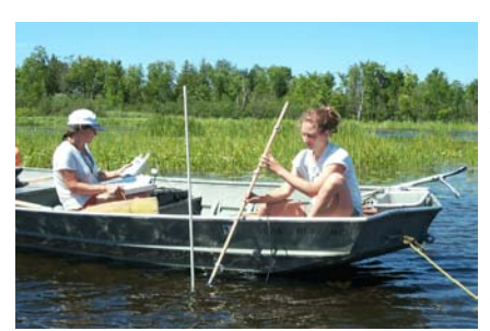
Water quality sampling in a Great Lakes coastal wetland.

A special edition of the Journal of Great Lakes Research (JGLR) summarizes a new generation of indicators for coastal change in the Great Lakes. These environmental indicators are benchmarks for the current conditions of the lakes' coastal region and provide